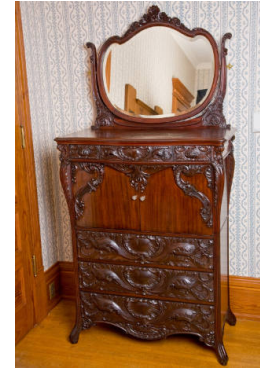
Title: Chiffonier Date: c. 1920 Primary Maker: Robert Mitchell Furniture Company Medium: mahogany with glass and metal