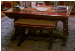
Title: Trestle Table Date: c. 1900 Primary Maker: Unknown American Medium: mahogany