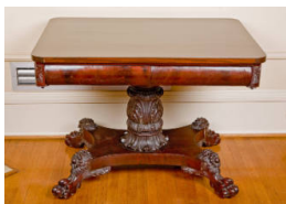
Title: Pedestal Table Date: c. 1920 Primary Maker: Robert Mitchell Furniture Company Medium: mahogany