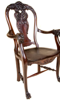
Title: Armchair Date: c.1900 Primary Maker: Robert Mitchell Furniture Company Medium: mahogany with cloth