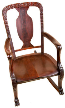
Title: Rocking Chair Date: c. 1920 Primary Maker: Robert Mitchell Furniture Company Medium: mahogany