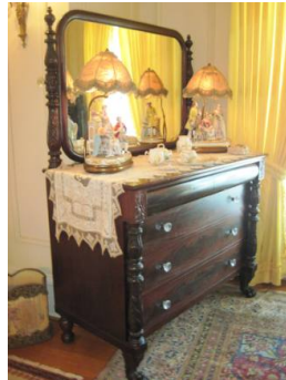
Title: Dresser Date: c. 1920 Primary Maker: Robert Mitchell Furniture Company Medium: mahogany with metal and glass