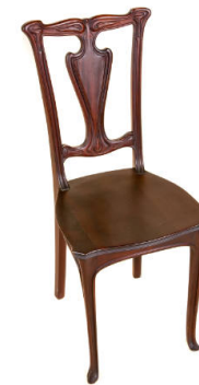
Title: Side Chair Date: c. 1920 Primary Maker: Robert Mitchell Furniture Company Medium: mahogany