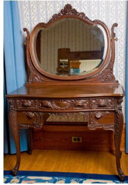
Title: Dressing Table Date: c. 1920 Primary Maker: Robert Mitchell Furniture Company Medium: mahogany with glass and metal