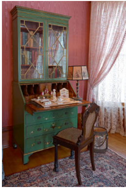
Title: Secretary Desk Date: c. 1840 Primary Maker: Unknown English Medium: mahogany, pine, and oak with glass, metal, and leather