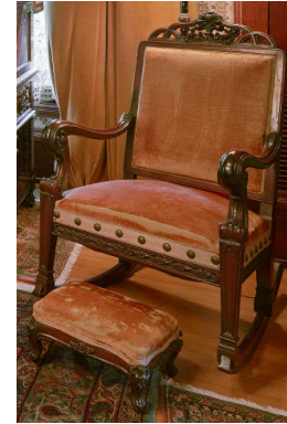
Title: Rocking Chair Date: c. 1900 Primary Maker: Unknown American Medium: mahogany with cloth and brass