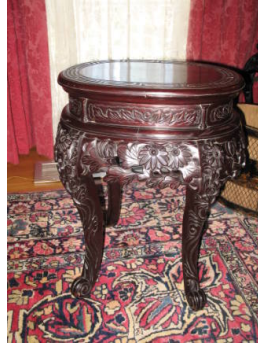
Title: Stool Date: c.1900 Primary Maker: Unknown Chinese Medium: mahogany