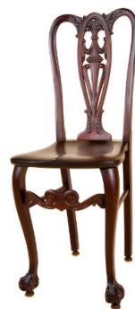
Title: Side Chair Date: c. 1920 Medium: mahogany