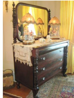
Title: Dresser Date: c. 1920 Primary Maker: Robert Mitchell Furniture Company Medium: mahogany with metal and glass