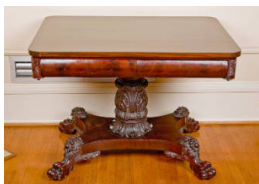
Title: Pedestal Table Date: c. 1920 Primary Maker: Robert Mitchell Furniture Company Medium: mahogany