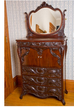
Title: Chiffonier Date: c. 1920 Primary Maker: Robert Mitchell Furniture Company Medium: mahogany with glass and metal