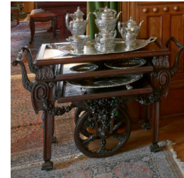
Title: Tea Cart Date: c. 1900 Primary Maker: Unknown American Medium: mahogany with metal