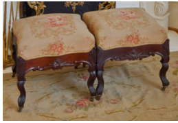
Title: Stool Date: c. 1900 Primary Maker: Unknown American Medium: mahogany with cloth and brass