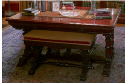
Title: Trestle Table Date: c. 1900 Primary Maker: Unknown American Medium: mahogany