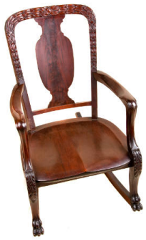
Title: Rocking Chair Date: c. 1920 Primary Maker: Robert Mitchell Furniture Company Medium: mahogany