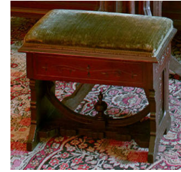
Title: Footstool Date: c. 1850 Primary Maker: Unknown American Medium: walnut with velvet and brass