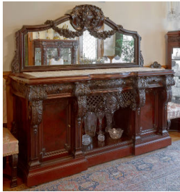
Title: Sideboard Date: c. 1900 Primary Maker: Unknown American Medium: mahogany with glass and metal