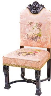
Title: Dining Room Side Chair Date: c.1900 Medium: mahogany with metal and silk with burlap, linen and horse hair