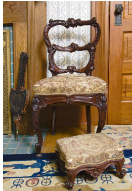
Title: Side Chair Date: c. 1920 Medium: mahogany with metal and brocade velvet