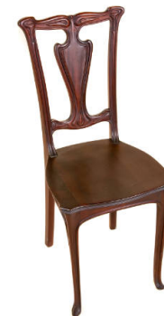
Title: Side Chair Date: c. 1920 Primary Maker: Robert Mitchell Furniture Company Medium: mahogany