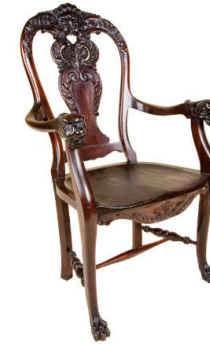
Title: Armchair Date: c.1900 Primary Maker: Robert Mitchell Furniture Company Medium: mahogany with cloth