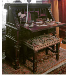
Title: Fall-Front Desk Date: c. 1900 Primary Maker: Unknown American Medium: mahogany