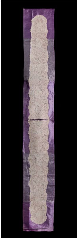
Title: Lappet Date: 18th century Primary Maker: Unknown French Medium: lace; silk