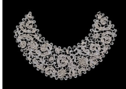
Title: Collar Date: 18th century Primary Maker: Unknown Italian Medium: linen