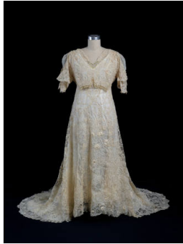
Title: Dress Date: c. 1900 Primary Maker: Unknown French Medium: lace and silk with faux pearls and metal