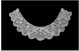
Title: Flounce Date: 18th Century Primary Maker: Unknown Flemish Medium: lace