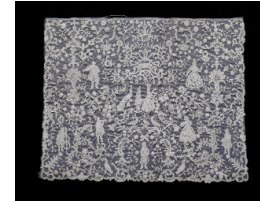
Title: Jabot Date: 18th Century Primary Maker: Unknown French Medium: lace; fabric