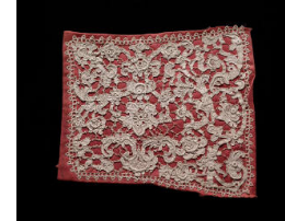
Title: Jabot Date: 17th Century Primary Maker: Unknown Italian Medium: gros point lace with fabric backing