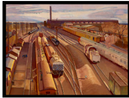
Title: The Chief Goes Through Date: 1956 Primary Maker: Ernest Leonard Blumenschein Medium: oil on canvas