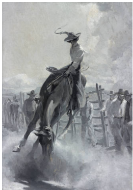
Title: Judith's Spurs Answered Him, and the Bit . . . Brought Him About, Whirling . . . Bucking as Only . . . a Devil-Hearted Horse Knows How to Buck Date: c. 1919 Primary Maker: William Herbert Dunton Medium: oil on canvas