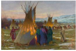
Title: Council Call of Crows, Montana Date: c. 1908 Primary Maker: Joseph Henry Sharp Medium: oil on canvas