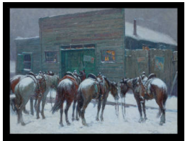
Title: The Faithful Ponies Date: 1918 Primary Maker: Oscar Edmund Berninghaus Medium: oil on canvas