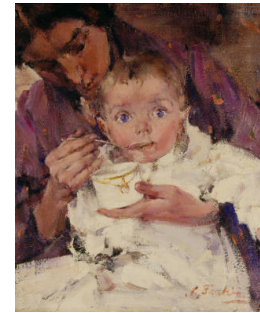
Title: Mother and Child