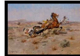
Title: Incident near Square Butte