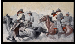
Title: I've Seen Him Ride Broncs That Had Piled the Best of Them, and as for Roping -- Even the Mexican Vaqueros Have Had to Hand It to Him More Than Once