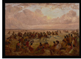
Title: Indian Women Playing Ball on the Prairie