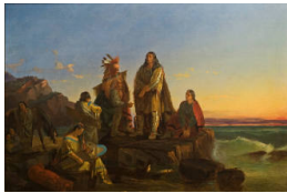
Title: The Last of Their Race