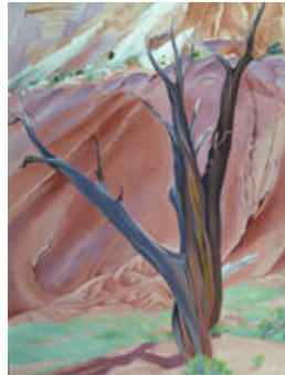
Title: Gerald's Tree II