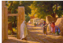
Title: An Old Street in Taos - (Kit) Carson Street