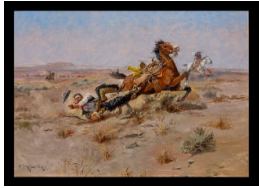
Title: Incident near Square Butte Date: 1897 Primary Maker: Charles Marion Russell Medium: oil on canvas