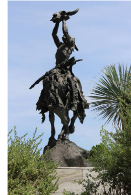
Title: The Invocation Date: 2003, modeled in 1990 Primary Maker: Buck McCain Medium: bronze