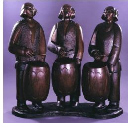
Title: Chant of the Rio Grande Date: 1987 Primary Maker: Allan C. Houser Medium: cast bronze