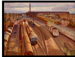
Title: The Chief Goes Through Date: 1956 Primary Maker: Ernest Leonard Blumenschein Medium: oil on canvas