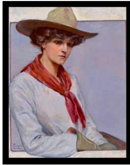
Title: Cowgirl with Red Scarf Primary Maker: William Herbert Dunton Medium: oil on canvas