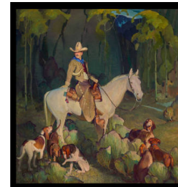
Title: McMullin, Guide Date: c. 1934 Primary Maker: William Herbert Dunton Medium: oil on canvas