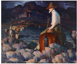
Title: The Cattle Buyer Date: c. 1921 Primary Maker: William Herbert Dunton Medium: oil on canvas