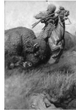
Title: The Fellow Lowered His Head and Turned on Me Date: 1908 Primary Maker: William Herbert Dunton Medium: oil on canvas