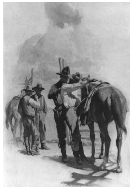
Title: A Lean Muscular Hand Fell Lightly Upon His Shoulder and He was Jerked Back Promptly Date: c. 1919 Primary Maker: William Herbert Dunton Medium: oil on canvas