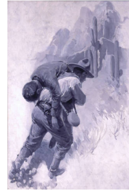
Title: You Poor Devil Date: c. 1920 Primary Maker: William Herbert Dunton Medium: oil on canvas