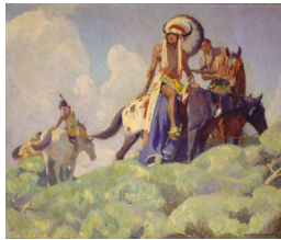
Title: The Hostiles Date: 1915 Primary Maker: William Herbert Dunton Medium: oil on canvas