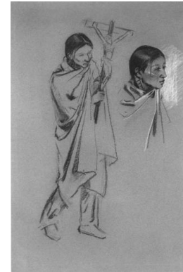
Title: Indian with Crucifix