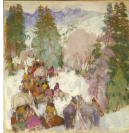
Title: To the Christmas Dance