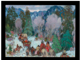
Title: To the Taos Christmas Dance

Primary Maker: Leon Gaspard Medium: gouache on paper mounted on paperboard