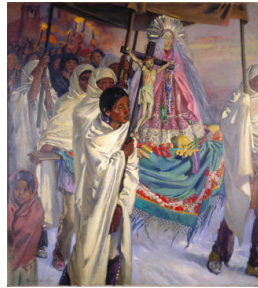
Title: Christmas Eve with the Indians of New Mexico