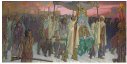
Title: Christmas Eve Procession, Leaving the Church