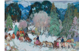
Title: To the Christmas Fiesta