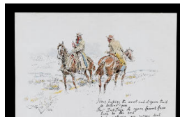
Title: Heres Hoping the Worst End of Your Trail Is behind You Date: 1926 Primary Maker: Charles Marion Russell Medium: printed, hand-colored with watercolor on paperboard