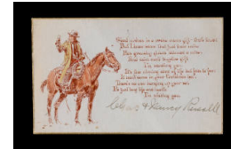
Title: Good Wishes Is a Broke Man's Gift – That's True [To John Young-Hunter] Date: 1920 Primary Maker: Charles Marion Russell Medium: printed in brown ink, hand-colored with watercolor on paperboard