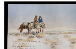
Title: Here's Hoping Your Trail is a Long One Date: 1924 Primary Maker: Charles Marion Russell Medium: photomechanical print, hand-colored