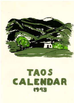
Title: Taos Calendar-1943 Date: 1942 Primary Maker: Helen Greene Blumenschein Medium: silkscreen on paper