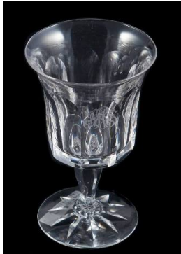
Title: Goblet Date: c. 1915 Primary Maker: T.G. Hawkes & Company Medium: cut glass