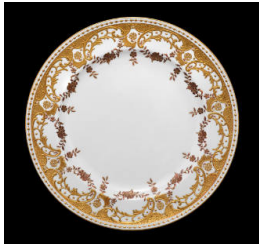
Title: Service Plate Date: 1891-1912 Primary Maker: Mintons Medium: porcelain