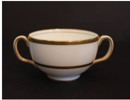
Title: Bouillon Cup Date: 1873 - 1891 Primary Maker: Mintons Medium: porcelain with gold