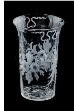
Title: Drinking Glass Date: 1905 Primary Maker: T.G. Hawkes & Company Medium: engraved glass