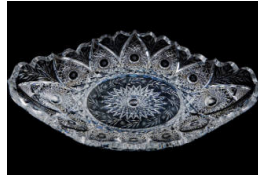
Title: Ice Cream Tray Date: c. 1900 Primary Maker: Pairpoint Manufacturing Company Medium: cut glass