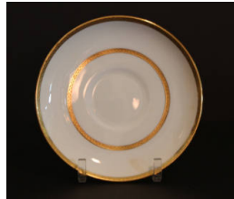
Title: Bouillon Cup Saucer Date: 1891 - 1912 Primary Maker: Mintons Medium: porcelain with gold