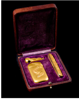
Title: Match Safe Primary Maker: Unknown German Medium: gilt-brass with diamond