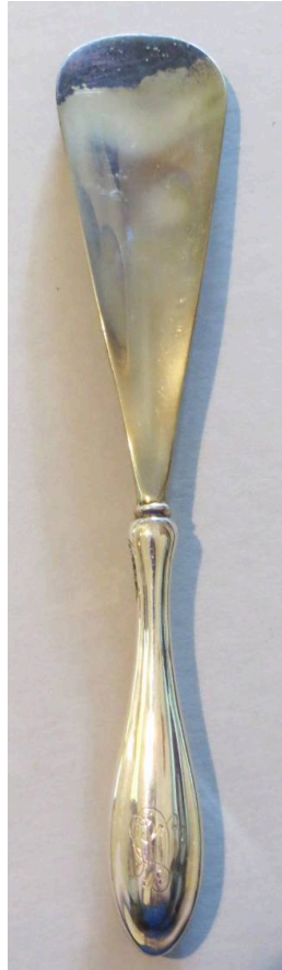
Title: Shoehorn Date: c. 1900 Primary Maker: Unger Brothers Medium: sterling silver with silver plate