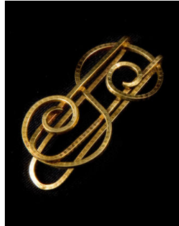
Title: Money Clip Medium: gold (14K)