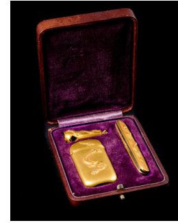
Title: Pocket Knife Primary Maker: Unknown German Medium: gilt-brass with diamond and other metal