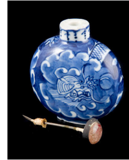
Title: Snuff Bottle Medium: porcelain