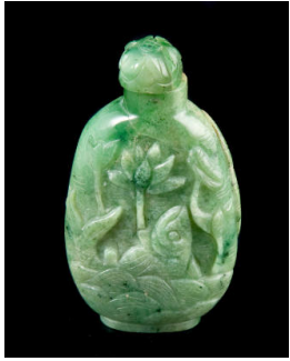
Title: Snuff Bottle Primary Maker: Unknown Chinese Medium: carved green jade