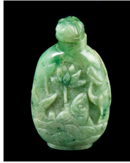
Title: Snuff Bottle Stopper Medium: jade