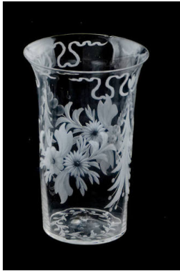
Title: Drinking Glass Date: 1905 Primary Maker: T.G. Hawkes & Company Medium: engraved glass