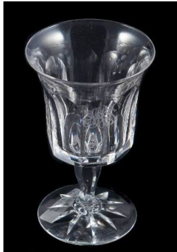
Title: Goblet Date: c. 1915 Primary Maker: T.G. Hawkes & Company Medium: cut glass