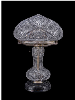
Title: Table Lamp Shade Date: c. 1880-1917 Primary Maker: T.G. Hawkes & Company Medium: cut glass with silver plate and metal