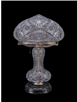
Title: Table Lamp Date: c. 1880-1917 Primary Maker: T.G. Hawkes & Company Medium: cut glass with silver plate and metal