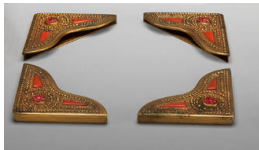
Title: Blotter Corner Date: c. 1898-1906 Primary Maker: Tiffany Studios Medium: bronze with favrile glass