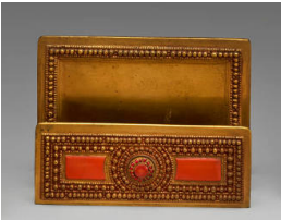
Title: Letter Holder Date: c. 1898-1906 Primary Maker: Tiffany Studios Medium: bronze with favrile glass