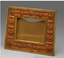
Title: Desk Calendar Date: c. 1898-1906 Primary Maker: Tiffany Studios Medium: bronze with favrile glass