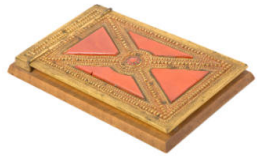
Title: Notepad Holder Date: c. 1898-1906 Primary Maker: Tiffany Studios Medium: bronze with favrile glass and wood