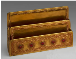
Title: Letter Holder Date: c. 1898-1906 Primary Maker: Tiffany Studios Medium: bronze with favrile glass