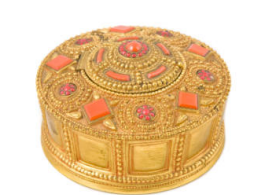
Title: Inkwell Date: c. 1898-1906 Primary Maker: Tiffany Studios Medium: bronze with favrile glass