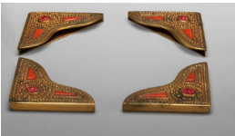
Title: Blotter Corner Date: c. 1898-1906 Primary Maker: Tiffany Studios Medium: bronze with favrile glass