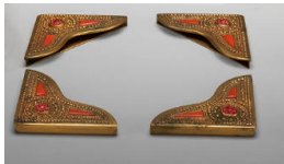
Title: Blotter Corner Date: c. 1898-1906 Primary Maker: Tiffany Studios Medium: bronze with favrile glass