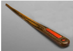
Title: Letter Opener Date: c. 1898-1906 Primary Maker: Tiffany Studios Medium: bronze with favrile glass