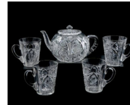
Title: Handled Tea Mug Date: c. 1900 Primary Maker: H.P. Sinclair & Company Medium: cut glass