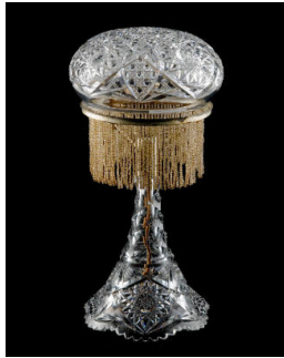
Title: Boudoir Lamp Date: c. 1876-1917 Medium: cut glass; gilded silver