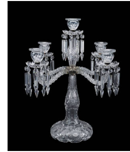
Title: Candelabra Primary Maker: T.G. Hawkes & Company Medium: cut glass with silver