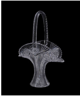
Title: Basket Primary Maker: T.G. Hawkes & Company Medium: cut glass