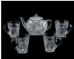
Title: Handled Tea Mug Date: c. 1900 Primary Maker: H.P. Sinclair & Company Medium: cut glass