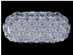
Title: Celery Platter Date: c. 1903 Primary Maker: T.G. Hawkes & Company Medium: cut glass