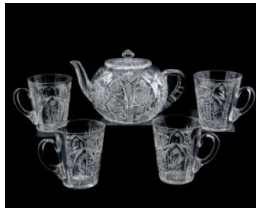
Title: Handled Tea Mug Date: c. 1900 Primary Maker: H.P. Sinclair & Company Medium: cut glass