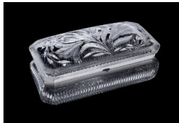
Title: Glove Box Date: 1880-1917 Primary Maker: Pairpoint Manufacturing Company Medium: cut glass with silver plate