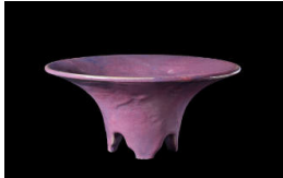
Title: Vase Date: 1915 - 1925 Primary Maker: Fulper Pottery Company Medium: earthenware with lavender glaze