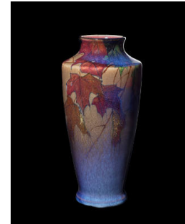
Title: Vase Date: 1922 Primary Maker: Kataro Shirayamadani Medium: earthenware with black iris glaze