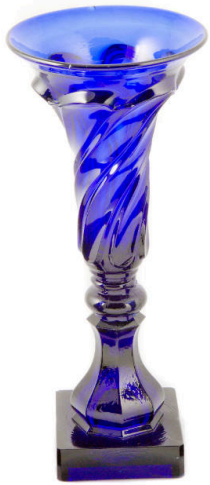
Title: Vase Primary Maker: Unknown American Medium: flint glass