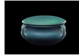
Title: Powder Jar Lid Date: c. 1910 Primary Maker: Rookwood Pottery Company Medium: earthenware with matte glaze