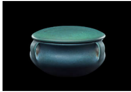
Title: Powder Jar Date: c. 1910 Primary Maker: Rookwood Pottery Company Medium: earthenware with matte glaze