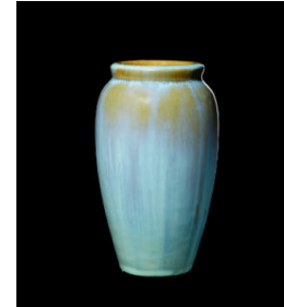
Title: Vase Date: 1915 - 1925 Primary Maker: Fulper Pottery Company Medium: earthenware with green-ice blue glaze