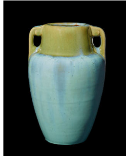
Title: Vase Date: 1915 - 1920 Primary Maker: Fulper Pottery Company Medium: earthenware with jade glaze