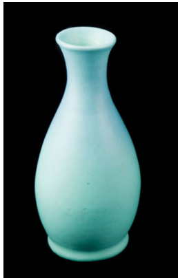
Title: Vase Date: mid-20th century Primary Maker: Van Briggie Pottery Medium: earthenware with Ming blue glaze