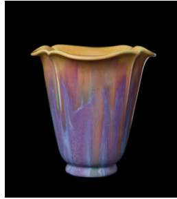
Title: Vase Date: c. 1932 Primary Maker: Rookwood Pottery Company Medium: earthenware with flambé glaze