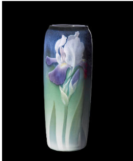
Title: Vase Date: c. 1910 Primary Maker: Carl Schmidt Medium: earthenware with glaze