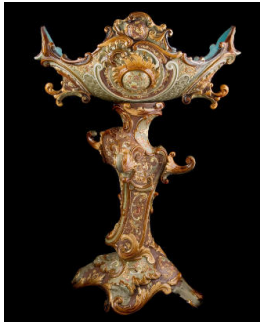
Title: Centerpiece Primary Maker: Wilhelm Schiller Medium: earthenware glazed Majolica with metal