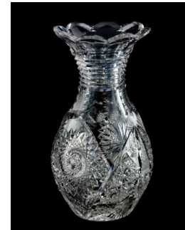
Title: Vase Date: c. 1900 Primary Maker: Unknown American Medium: cut glass