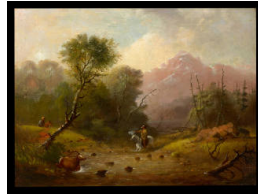
Title: Lord Stewart Shooting the Elk