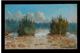
Title: Pin Portage