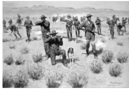
Title: "Bullets Kicked Up the Dust," Date: 1902 Primary Maker: Frederic Remington Medium: oil on canvas