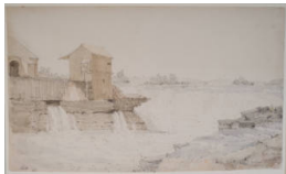
Title: Fort Frances Date: 1848 Primary Maker: Paul Kane Medium: watercolor and pencil on paper