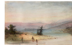
Title: Enroute, Rocky Mountains Date: 1837 Primary Maker: Alfred Jacob Miller Medium: watercolor on paper