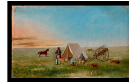
Title: Camping on the Prairie Date: 1846 Primary Maker: Paul Kane Medium: oil on paper