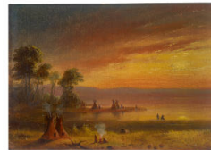
Title: Indian Encampment at Sunset Date: 1837 Primary Maker: Alfred Jacob Miller Medium: oil on paper