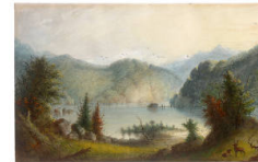
Title: Lake in Wind River Mountains Date: after 1837 Primary Maker: Alfred Jacob Miller Medium: watercolor, pen and ink on paper