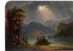
Title: Storm on Wind River Lake, Rocky Mountains