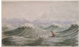
Title: Crossing the Strait of Juan de Fuca Date: 1847 Primary Maker: Paul Kane Medium: watercolor and pencil on paper