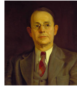
Title: Oscar E. Berninghaus