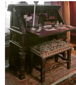
Title: Fall-Front Desk Date: c. 1900 Primary Maker: Unknown American Medium: mahogany