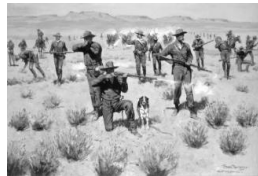
Title: "Bullets Kicked Up the Dust," Date: 1902 Primary Maker: Frederic Remington Medium: oil on canvas