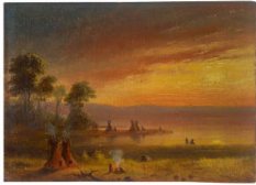
Title: Indian Encampment at Sunset Date: 1837 Primary Maker: Alfred Jacob Miller Medium: oil on paper