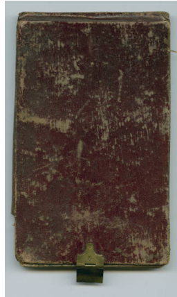
Title: Journal, 1846-1848 Journey Date: 1846-1848 Primary Maker: Paul Kane Medium: pen and pencil on paper, bound in leather with brass clasp