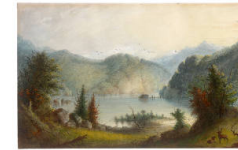
Title: Lake in Wind River Mountains Date: after 1837 Primary Maker: Alfred Jacob Miller Medium: watercolor, pen and ink on paper