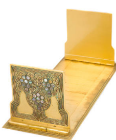
Title: Bookend Date: c. 1900 Primary Maker: Louis Comfort Tiffany Medium: brass with abalone shell