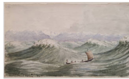
Title: Crossing the Strait of Juan de Fuca Date: 1847 Primary Maker: Paul Kane Medium: watercolor and pencil on paper