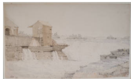
Title: Fort Frances Date: 1848 Primary Maker: Paul Kane Medium: watercolor and pencil on paper