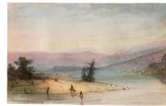
Title: Enroute, Rocky Mountains Date: 1837 Primary Maker: Alfred Jacob Miller Medium: watercolor on paper