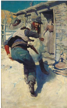
Title: "At the Same Time Hahn Pulled His Gun and Shot Him through the Middle" Date: 1906 Primary Maker: N. C. Wyeth Medium: oil on canvas