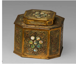
Title: Inkwell Date: c. 1900 Primary Maker: Louis Comfort Tiffany Medium: brass with abalone shell