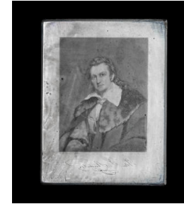
Title: John James Audubon Date: 1835 Primary Maker: Charles Turner Medium: metal