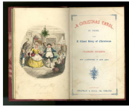
Title: A Christmas Carol Date: 1843 Primary Maker: Charles Dickens Medium: engraving on paper, hand-colored; text printed on paper; bound with marbles boards, rose leather spine and corners