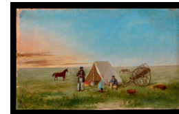
Title: Camping on the Prairie Date: 1846 Primary Maker: Paul Kane Medium: oil on paper