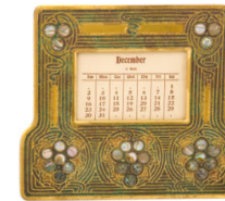
Title: Desk Calendar Date: c. 1900 Primary Maker: Louis Comfort Tiffany Medium: brass with abalone shell and glass