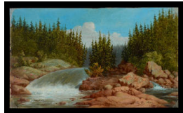
Title: Dog Portage Date: 1846 Primary Maker: Paul Kane Medium: oil on paper