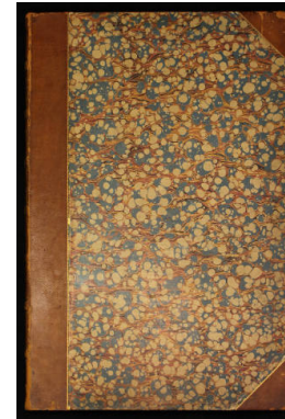
Title: The Birds of America Date: 1827-1838 Primary Maker: John James Audubon Medium: etching and aquatint on paper, hand-colored; bound brown half-calf spines and corners some gilding, front and back paper geometric design.