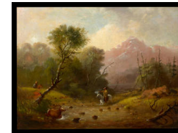
Title: Lord Stewart Shooting the Elk Date: c. 1859 Primary Maker: Alfred Jacob Miller Medium: oil on mahogany panel