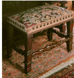
Title: Bench Date: c. 1900 Primary Maker: Unknown American Medium: mahogany with cloth and brass