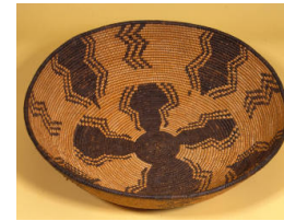
Title: Basket Date: c. 1900 Primary Maker: Apache Medium: woven willow and devil's claw