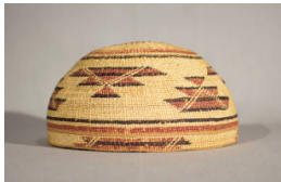
Title: Basket Hat Date: c. 1900-1910 Primary Maker: Yurok Medium: woven ridge roots, bulrush roots, and redbud with maidenhair fern