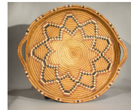
Title: Tray Date: c. 1920 Primary Maker: Nlaka'pamux (Thompson River Salish) Medium: woven spruce with redbud and grass