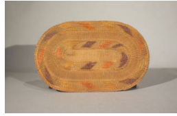
Title: Basket Tray Date: c. 1920 Primary Maker: Tlingit Medium: woven spruce root and dyed grass