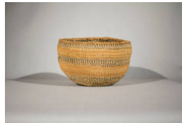
Title: Basket Date: c. 1920 Primary Maker: Modoc Medium: woven spruce root and redbud