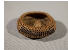
Title: Miniature Basket Date: c. 1900-1910 Primary Maker: Akimel O'odham Medium: woven yucca, willow and devil's claw