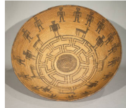
Title: Storage Basket Date: c. 1900 Primary Maker: Apache Medium: woven sumac, devil's claw, and split willow