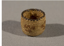
Title: Miniature Basket Date: c. 1900-1910 Primary Maker: Akimel O'odham Medium: woven yucca, willow and devil's claw