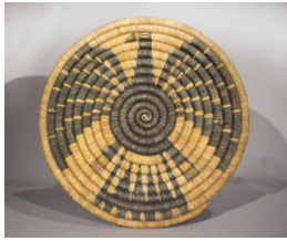
Title: Plaque Primary Maker: Unknown American Indian Medium: woven wood