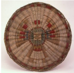
Title: Plaque Date: c. 1860-1875 Primary Maker: Hopi Medium: woven wood with natural dyes