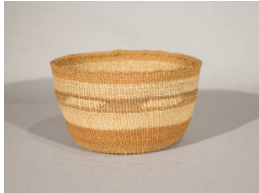
Title: Basket Date: c. 1910 Primary Maker: Klamath Medium: woven spruce root and hemp