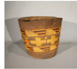
Title: Basket Date: c. 1890 Primary Maker: Tlingit Medium: woven spruce root and dyed grass