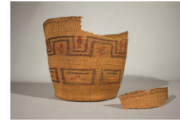
Title: Basket Date: c. 1920 Primary Maker: Tlingit Medium: woven spruce root and dyed grass