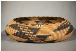
Title: Basket Date: c. 1890 Primary Maker: Pomo Medium: woven redbud and willow with clam shell beads