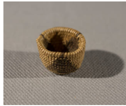
Title: Miniature Basket Date: c. 1900-1910 Primary Maker: Akimel O'odham Medium: woven yucca, willow and devil's claw