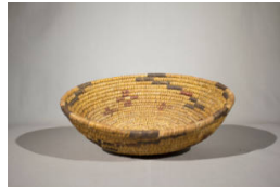
Title: Basket Date: c. 1900 Primary Maker: Mescalero Apache Medium: woven sumac, devil's claw, and split willow with hand-painting