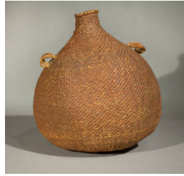
Title: Water Jar Date: c. 1880-1890 Primary Maker: Apache Medium: woven sumac, devil's claw, and split willow