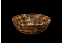
Title: Basket Date: 1900-1910 Primary Maker: Apache Medium: woven sumac, devil's claw, and split willow