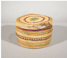
Title: Covered Basket Date: c. 1880-1890 Primary Maker: Makah Medium: woven cedar bark or hemp with cedar, grass, and natural dyes