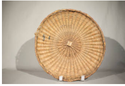
Title: Basket Plaque Primary Maker: Hopi Medium: woven reed and grass