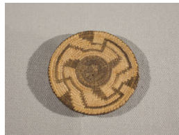
Title: Miniature Plaque Date: c. 1900-1910 Primary Maker: Akimel O'odham Medium: woven yucca, willow and devil's claw