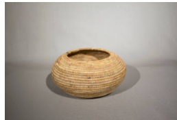
Title: Basket Date: c. 1860-1880 Primary Maker: Pomo Medium: woven split willow