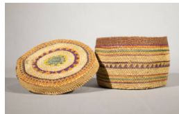
Title: Lid for Basket Date: c. 1880-1890 Primary Maker: Makah Medium: woven cedar bark or hemp with cedar, grass, and natural dyes