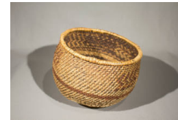
Title: Basket Date: c. 1920 Primary Maker: Hualapai Medium: woven sumac and willow