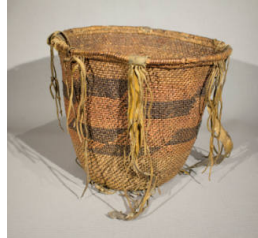
Title: Burden Basket Date: c. 1880 Primary Maker: Apache Medium: woven sumac, devil's claw and split willow