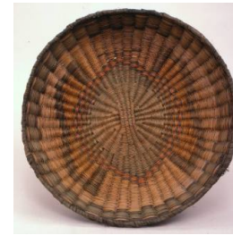
Title: Basket Primary Maker: Hopi Medium: woven rabbit brush and currant brush with vegetable dyes