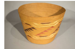
Title: Basket Date: c. 1900 Primary Maker: Tlingit Medium: woven spruce root and natural dyes