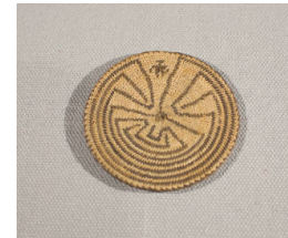
Title: Miniature Plaque Date: c. 1900-1910 Primary Maker: Akimel O'odham Medium: woven yucca, willow and devil's claw