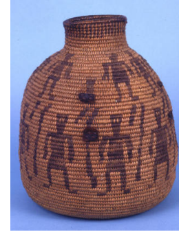
Title: Basket Date: c. 1880 Primary Maker: Apache Medium: woven sumac, devil's claw, and split willow with leather