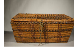
Title: Box Date: c. 1890 Primary Maker: Nlaka'pamux (Thompson River Salish) Medium: woven wood and leather