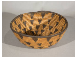
Title: Basket Date: c. 1900-1910 Primary Maker: Apache Medium: woven sumac, devil's claw, and split willow