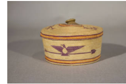
Title: Basket Date: c. 1850-1880 Medium: woven grass