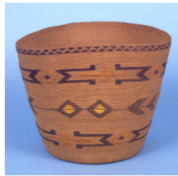
Title: Basket Date: c. 1900 Primary Maker: Tlingit Medium: woven spruce root and natural dyes