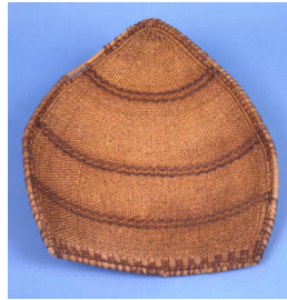
Title: Wincwing Tray Primary Maker: Tohono O'odham Medium: woven split willow