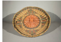
Title: Plaque Date: c. 1890 Primary Maker: Hopi Medium: woven sumac, with dyed sumac