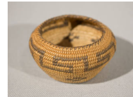
Title: Miniature Basket Date: c. 1900-1910 Primary Maker: Akimel O'odham Medium: woven yucca, willow and devil's claw