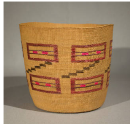
Title: Basket Date: c. 1900 Primary Maker: Tlingit Medium: woven spruce root with natural dyes