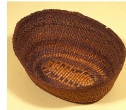
Title: Basket Date: c. 1910 Primary Maker: Klamath Medium: woven redbud and grass