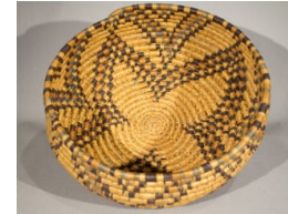
Title: Basket Date: c. 1900-1920 Primary Maker: Mission Indians Medium: woven grass and natural dyes