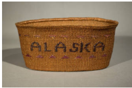
Title: Basket Date: c. 1920 Primary Maker: Tlingit Medium: woven spruce root with dyed grass