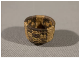
Title: Miniature Basket Date: c. 1900-1910 Primary Maker: Akimel O'odham Medium: woven yucca, willow and devil's claw