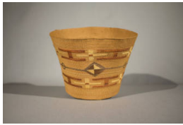
Title: Basket Date: c. 1890-1900 Primary Maker: Tlingit Medium: woven spruce root with natural dyes