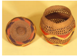
Title: Basket Date: c. 1900 Primary Maker: Tlingit Medium: woven spruce root and dyed grass