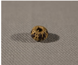
Title: Miniature Basket Date: c. 1900-1910 Primary Maker: Akimel O'odham Medium: woven yucca, willow and devil's claw