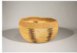
Title: Basket Date: c. 1925 Primary Maker: Klamath Medium: woven spruce root with redbud and grass