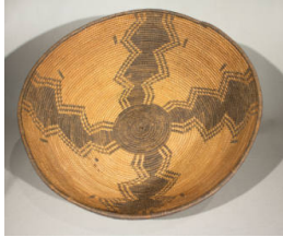
Title: Basket Date: c. 1890 Primary Maker: Apache Medium: woven sumac, devil's claw, and split willow