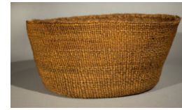
Title: Basket Date: c. 1900 Primary Maker: Klamath Medium: woven spruce root with grass