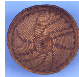
Title: Basket Date: c. 1900 Primary Maker: Apache Medium: woven sumac, devil's claw, and split willow