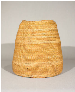
Title: Basket Date: c. 1900 Primary Maker: Klamath Medium: woven tule (bulrushes)