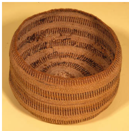
Title: Basket Date: c. 1920 Primary Maker: Modoc Medium: woven spruce root and redbud