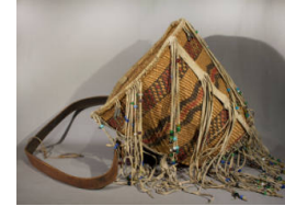
Title: Burden Basket Primary Maker: Apache Medium: woven sumac, devil's claw and split willow with red paint, leather, beads and metal bangles