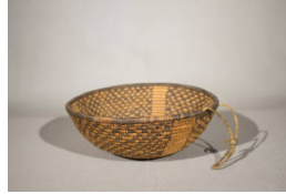
Title: Basket Date: c. 1885 Primary Maker: Apache Medium: woven sumac, devil's claw, and split willow