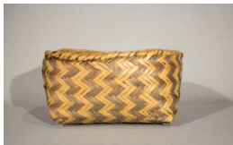
Title: Storage Basket Primary Maker: Choctaw Medium: woven split cane with dyed cane in zig-zag pattern