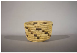
Title: Basket Primary Maker: Tohono O'odham Medium: woven yucca and devil's claw