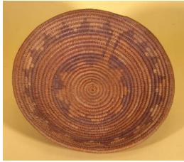
Title: Wedding Basket Date: c. 1900 Primary Maker: Diné (Navajo) Medium: woven devil's claw and willow