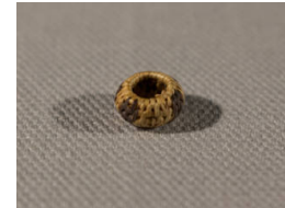
Title: Miniature Basket Date: c. 1900-1910 Primary Maker: Akimel O'odham Medium: woven yucca, willow and devil's claw