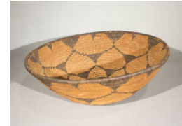
Title: Basket Date: c. 1900 Primary Maker: Apache Medium: woven sumac, devil's claw and split willow