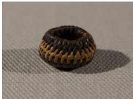
Title: Miniature Basket Date: c. 1900-1910 Primary Maker: Akimel O'odham Medium: woven yucca, willow and devil's claw