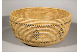
Title: Basket Date: c. 1900 Primary Maker: Inuit Medium: woven grass with seal skin