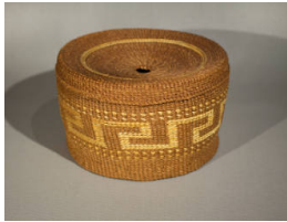
Title: Basket Date: c. 1920 Primary Maker: Tlingit Medium: woven cedar and dyed grass