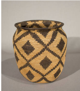
Title: Basket Date: c. 1900-1920 Primary Maker: Apache Medium: woven willow and devil's claw