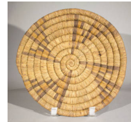
Title: Basket Plaque Primary Maker: Hopi Medium: woven reed and grass