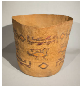
Title: Basket Primary Maker: Tlingit Medium: woven spruce root with dyed grass