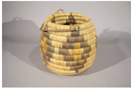
Title: Basket Date: c. 1890 Primary Maker: Hopi Medium: woven yucca with vegetable dyes