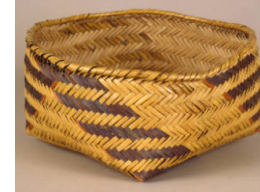
Title: Storage Basket Primary Maker: Choctaw Medium: woven split cane with dyed cane in herringbone pattern