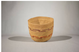
Title: Basket Date: c. 1900 Primary Maker: Tlingit Medium: woven spruce root with grass and natural dyes