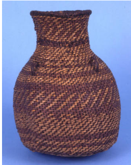
Title: Burden Basket Date: c. 1900-1920 Primary Maker: Apache Medium: woven split willow, and sumac