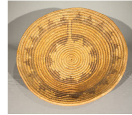
Title: Wedding Basket Date: c. 1890 Primary Maker: Diné (Navajo) Medium: woven willow with dyed sumac