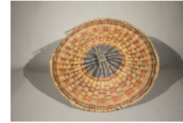
Title: Plaque Date: c. 1890 Primary Maker: Hopi Medium: woven sumac, with dyed sumac