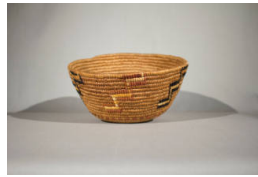
Title: Basket Date: c. 1890 Primary Maker: Nlaka'pamux (Thompson River Salish) Medium: woven cedar and dyed reed