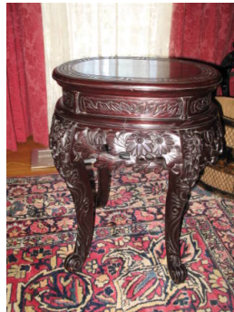
Title: Stool Date: c.1900 Primary Maker: Unknown Chinese Medium: mahogany