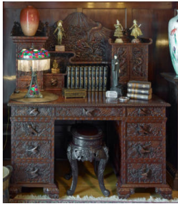
Title: Kneehole Desk Date: c.1900 Primary Maker: Unknown Chinese Medium: mahogany