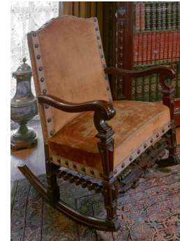
Title: Rocking Chair Date: c. 1900 Primary Maker: Unknown American Medium: mahogany with cloth and brass