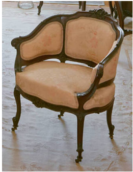
Title: Arm Chair Date: c.1900 Primary Maker: Unknown American Medium: mahogany with silk