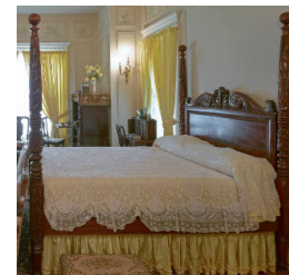
Title: Four Poster Bed Date: c. 1920 Primary Maker: Robert Mitchell Furniture Company Medium: mahogany with pine and metal