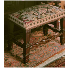
Title: Bench Date: c. 1900 Primary Maker: Unknown American Medium: mahogany with cloth and brass