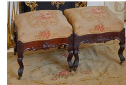
Title: Stool Date: c. 1900 Primary Maker: Unknown American Medium: mahogany with cloth and brass