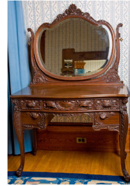
Title: Dressing Table Date: c. 1920 Primary Maker: Robert Mitchell Furniture Company Medium: mahogany with glass and metal