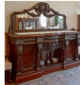
Title: Sideboard Date: c. 1900 Primary Maker: Unknown American Medium: mahogany with glass and metal