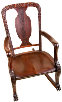
Title: Rocking Chair Date: c. 1920 Primary Maker: Robert Mitchell Furniture Company Medium: mahogany