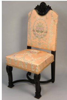
Title: Dining Room Side Chair Date: c.1900 Medium: mahogany with metal and silk with burlap, linen and horse hair