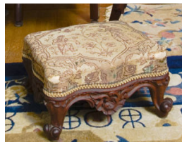
Title: Foot Stool Date: c. 1920 Medium: mahogany with brocade and metal