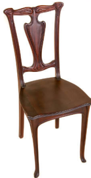
Title: Side Chair Date: c. 1920 Primary Maker: Robert Mitchell Furniture Company Medium: mahogany