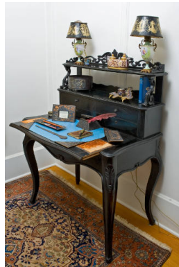
Title: Desk Date: c. 1900 Medium: mahogany with brass