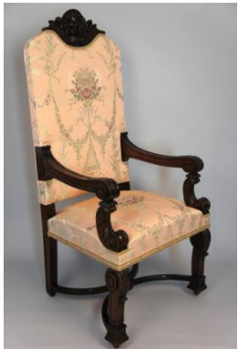
Title: Dining Room Armchair Date: c. 1900 Medium: mahogany with metal and silk with burlap, linen and horse hair