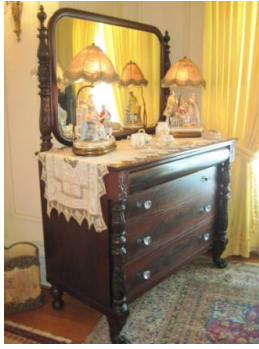
Title: Dresser Date: c. 1920 Primary Maker: Robert Mitchell Furniture Company Medium: mahogany with metal and glass