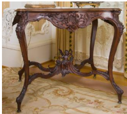
Title: Side Table Date: c. 1900 Primary Maker: Unknown American Medium: mahogany