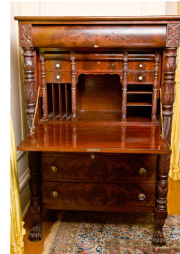
Title: Fall-Front Desk Date: c. 1920 Primary Maker: Robert Mitchell Furniture Company Medium: mahogany with glass and metal