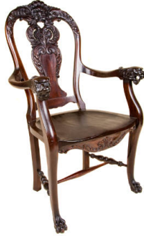
Title: Armchair Date: c.1900 Primary Maker: Robert Mitchell Furniture Company Medium: mahogany with cloth