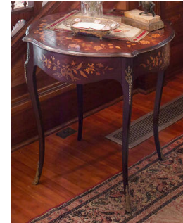
Title: Side Table Primary Maker: Unknown French Medium: mahogany with oak, satinwood, and ivory and metal