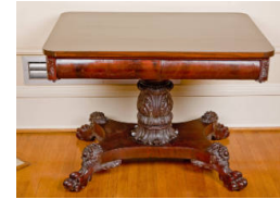
Title: Pedestal Table Date: c. 1920 Primary Maker: Robert Mitchell Furniture Company Medium: mahogany