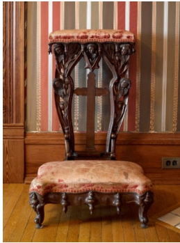
Title: Prie-Dieu Bench Date: c. 1890 Medium: mahogany; brocade