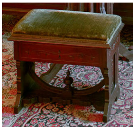
Title: Footstool Date: c. 1850 Primary Maker: Unknown American Medium: walnut with velvet and brass