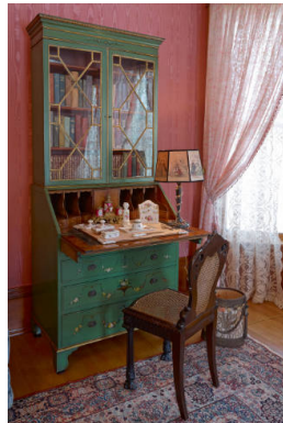
Title: Secretary Desk Date: c. 1840 Primary Maker: Unknown English Medium: mahogany, pine, and oak with glass, metal, and leather