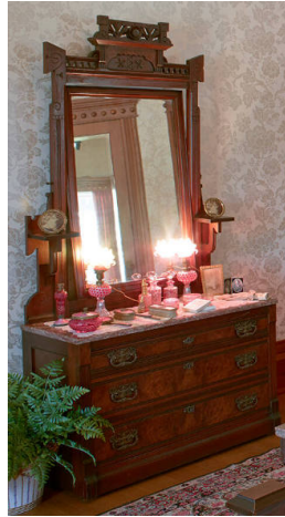
Title: Dresser Date: c. 1870 Primary Maker: Unknown American Medium: walnut with poplar, marble, brass, and glass