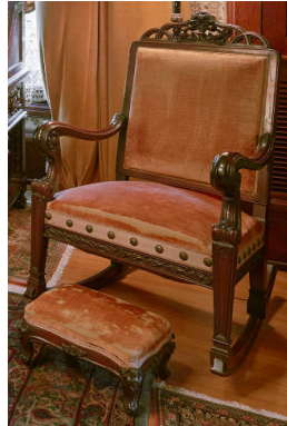
Title: Rocking Chair Date: c. 1900 Primary Maker: Unknown American Medium: mahogany with cloth and brass