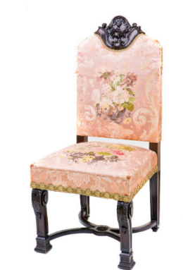
Title: Dining Room Side Chair Date: c.1900 Medium: mahogany with metal and silk with burlap, linen and horse hair