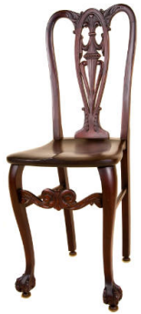
Title: Side Chair Date: c. 1920 Medium: mahogany