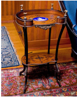
Title: End Table Date: c. 1900 Primary Maker: Unknown French Medium: wood and ebony with brass and porcelain