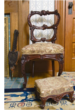
Title: Side Chair Date: c. 1920 Medium: mahogany with metal and brocade velvet