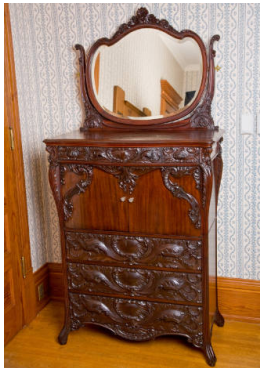
Title: Chiffonier Date: c. 1920 Primary Maker: Robert Mitchell Furniture Company Medium: mahogany with glass and metal