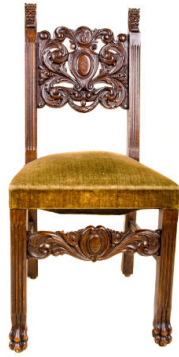
Title: Side Chair Date: c.1900 Medium: fumed oak with velvet and metal