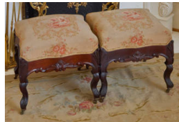
Title: Stool Date: c. 1900 Primary Maker: Unknown American Medium: mahogany with cloth and brass