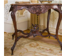
Title: Side Table Date: c. 1900 Primary Maker: Unknown American Medium: mahogany