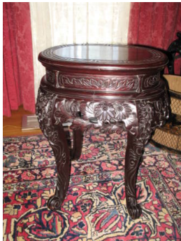
Title: Stool Date: c.1900 Primary Maker: Unknown Chinese Medium: mahogany