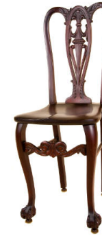
Title: Side Chair Date: c. 1920 Medium: mahogany