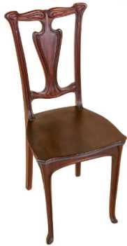
Title: Side Chair Date: c. 1920 Primary Maker: Robert Mitchell Furniture Company Medium: mahogany