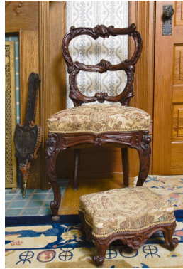
Title: Side Chair Date: c. 1920 Medium: mahogany with metal and brocade velvet