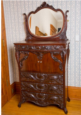
Title: Chiffonier Date: c. 1920 Primary Maker: Robert Mitchell Furniture Company Medium: mahogany with glass and metal