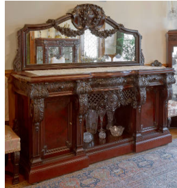
Title: Sideboard Date: c. 1900 Primary Maker: Unknown American Medium: mahogany with glass and metal