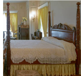
Title: Four Poster Bed Date: c. 1920 Primary Maker: Robert Mitchell Furniture Company Medium: mahogany with pine and metal