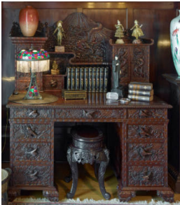
Title: Kneehole Desk Date: c.1900 Primary Maker: Unknown Chinese Medium: mahogany