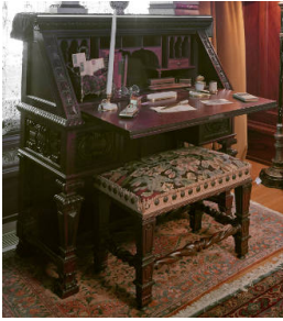
Title: Fall-Front Desk Date: c. 1900 Primary Maker: Unknown American Medium: mahogany