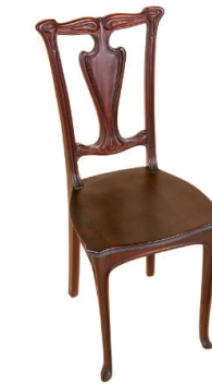
Title: Side Chair Date: c. 1920 Primary Maker: Robert Mitchell Furniture Company Medium: mahogany