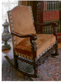
Title: Rocking Chair Date: c. 1900 Primary Maker: Unknown American Medium: mahogany with cloth and brass