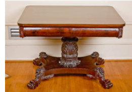
Title: Pedestal Table Date: c. 1920 Primary Maker: Robert Mitchell Furniture Company Medium: mahogany