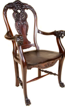
Title: Armchair Date: c.1900 Primary Maker: Robert Mitchell Furniture Company Medium: mahogany with cloth