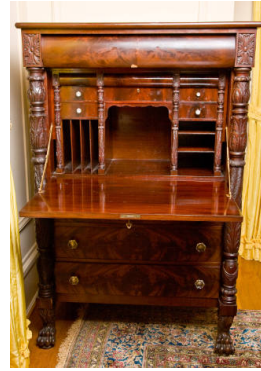
Title: Fall-Front Desk Date: c. 1920 Primary Maker: Robert Mitchell Furniture Company Medium: mahogany with glass and metal