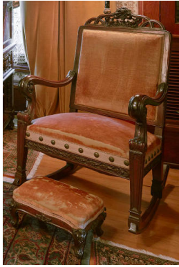
Title: Rocking Chair Date: c. 1900 Primary Maker: Unknown American Medium: mahogany with cloth and brass