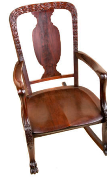
Title: Rocking Chair Date: c. 1920 Primary Maker: Robert Mitchell Furniture Company Medium: mahogany