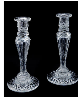
Title: Candlestick Primary Maker: Unknown American Medium: cut glass