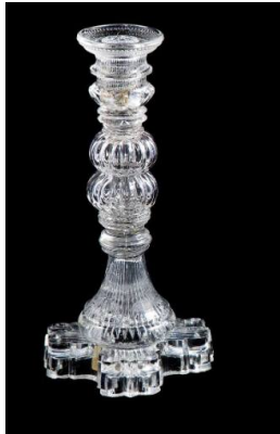
Title: Candlestick Medium: glass