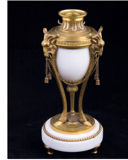
Title: Candlestick Primary Maker: Unknown French Medium: alabaster and bronze doré