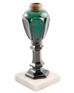
Title: Oil Lamp Base Primary Maker: Unknown American Medium: blown and pressed glass; marble; metal