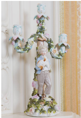
Title: Candelabra Date: c. 1900 Medium: porcelain