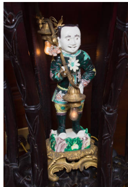
Title: Novelty Lamp Medium: brass; porcelain