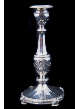
Title: Candlestick Primary Maker: Gorham Manufacturing Company Medium: sterling silver