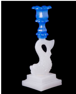
Title: Dolphin Candlestick Primary Maker: Unknown American Medium: glass