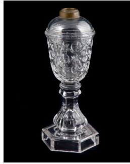
Title: Oil Lamp Base Primary Maker: Unknown American Medium: blown and pressed glass with metal