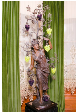
Title: Electric Lamp Date: c. 1900 Primary Maker: Karl Max Seifert Lamp Factory Medium: 7bronz with metal and glass