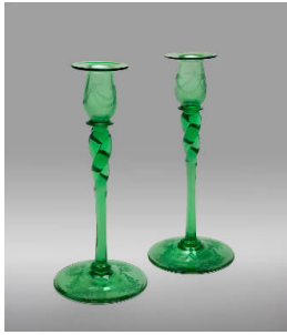
Title: Candlestick Date: c. 1920 Primary Maker: Frederick Carder Medium: engraved glass