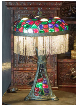
Title: Table Lamp Medium: metal and glass