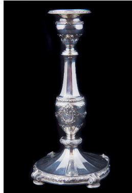
Title: Candlestick Date: c. 1910 Primary Maker: Gorham Manufacturing Company Medium: sterling silver