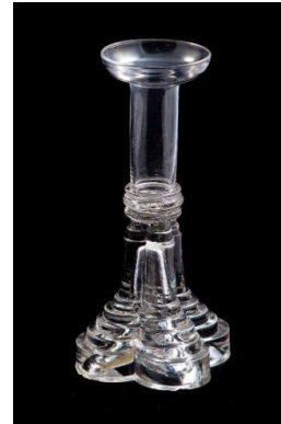
Title: Candlestick Medium: glass