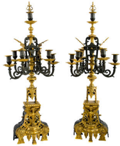
Title: Candelabra Medium: iron; bronze