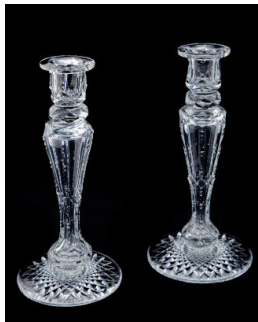
Title: Candlestick Date: c. 1900 Primary Maker: Unknown American Medium: cut glass