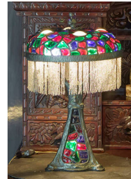
Title: Lamp Shade Medium: metal and glass