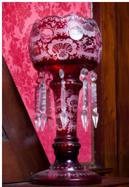
Title: Luster Medium: glass; metal