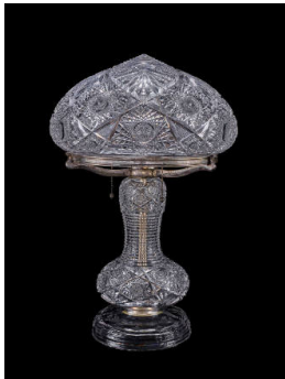
Title: Table Lamp Date: c. 1880-1917 Primary Maker: T.G. Hawkes & Company Medium: cut glass with silver plate and metal