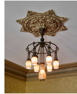
Title: Chandelier Date: 1903-1933 Primary Maker: Quezal Art Glass and Decorating Company Medium: bronze; glass