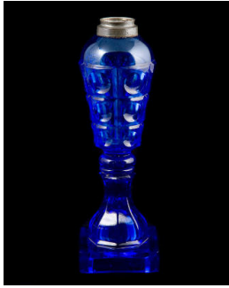
Title: Oil Lamp Base Primary Maker: Unknown American Medium: blown and pressed glass; metal