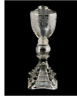
Title: Oil Lamp Base Primary Maker: Unknown American Medium: blown and pressed glass