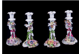
Title: Candlestick Date: c. 1907 Primary Maker: Schierholz Medium: porcelain