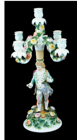
Title: Candelabra Date: c. 1887 Medium: porcelain