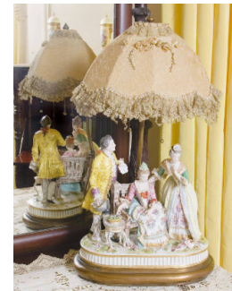
Title: Table Lamp Primary Maker: Dresden Medium: porcelain; metal