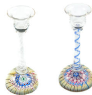
Title: Candlestick Date: c. 1850 Primary Maker: Whitefriars Glass Company Medium: glass