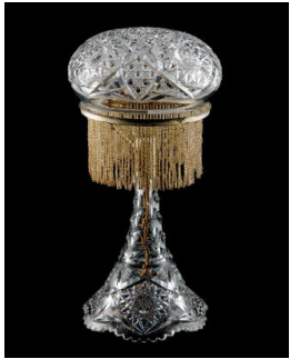
Title: Boudoir Lamp Date: c. 1876-1917 Medium: cut glass; gilded silver