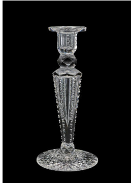
Title: Candlestick Date: c. 1900 Medium: cut glass