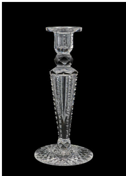
Title: Candlestick Date: c. 1900 Medium: cut glass