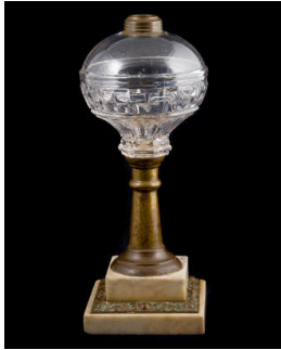
Title: Oil Lamp Base Primary Maker: Unknown American Medium: blown and pressed glass with metal and marble