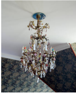
Title: Chandelier Medium: metal; enamel; glass