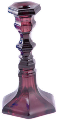
Title: Candlestick Primary Maker: Unknown American Medium: glass