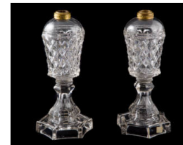
Title: Oil Lamp Base Primary Maker: Unknown American Medium: blown and pressed glass with brass