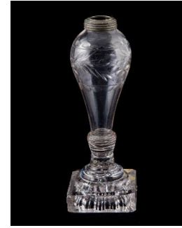
Title: Oil Lamp Base Primary Maker: Unknown American Medium: blown and pressed glass with metal