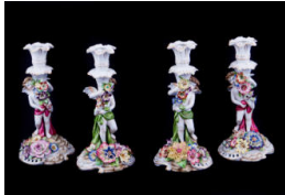
Title: Candlestick Date: c. 1907 Primary Maker: Schierholz Medium: porcelain