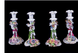
Title: Candlestick Date: c. 1907 Primary Maker: Schierholz Medium: porcelain