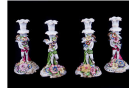
Title: Candlestick Date: c. 1907 Primary Maker: Schierholz Medium: porcelain