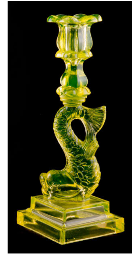
Title: Dolphin Candlestick Primary Maker: Unknown American Medium: glass