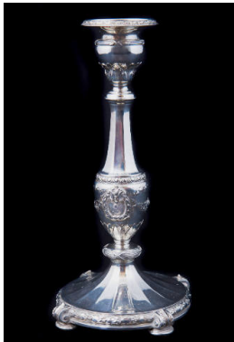
Title: Candlestick Primary Maker: Gorham Manufacturing Company Medium: sterling silver