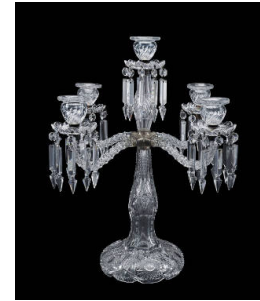
Title: Candelabra Primary Maker: T.G. Hawkes & Company Medium: cut glass with silver