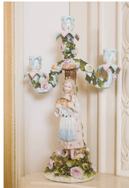
Title: Candelabra Date: c. 1900 Medium: porcelain