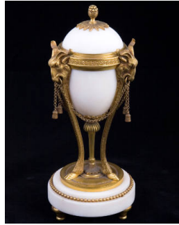
Title: Candlestick Primary Maker: Unknown French Medium: alabaster and bronze doré