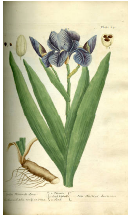
Title: Garden Flower de-luce. Iris nostras hortensis . Date: 1737 Primary Maker: Elizabeth Blackwell Medium: copper plate engraving on paper; hand-colored