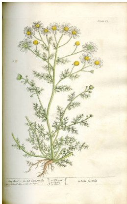
Title: May-Weed, or Faetid Camomile. Cotula faetida . Date: 1737 Primary Maker: Elizabeth Blackwell Medium: copper plate engraving on paper; hand-colored