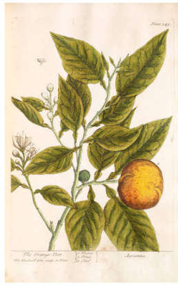
Title: The Orange Tree. Aurantia . Date: 1739 Primary Maker: Elizabeth Blackwell Medium: copper plate engraving on paper; hand-colored