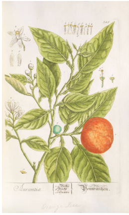
Title: Aurantia Date: 1760 Primary Maker: Elizabeth Blackwell Medium: Engraving