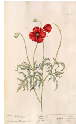
Title: Red, Wild, or Corn poppy. Papaver rubrum . Date: 1737 Primary Maker: Elizabeth Blackwell Medium: copper plate engraving on paper; hand-colored