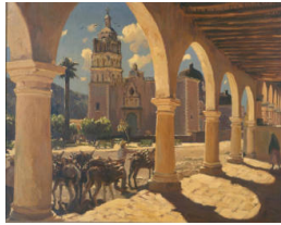
Title: The Arches of Alamos Mexico Primary Maker: Fremont F. Ellis Medium: oil on canvas