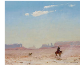
Title: Blowing Sand Primary Maker: Fremont F. Ellis Medium: oil on canvas board