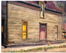
Title: The Clapboard House Date: 1925 Primary Maker: Fremont F. Ellis Medium: oil on panel