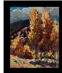
Title: Fall Aspens Primary Maker: Fremont F. Ellis Medium: oil on canvas