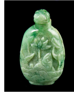
Title: Snuff Bottle Stopper Medium: jade