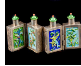
Title: Snuff Bottle Primary Maker: Unknown Chinese Medium: metal; enamel