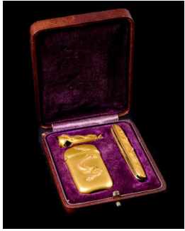
Title: Presentation Case Primary Maker: Unknown German Medium: leather, fabric, and metal