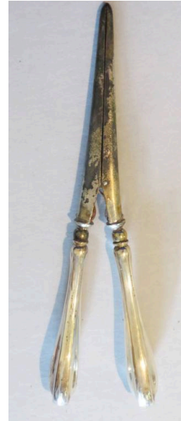
Title: Glove Stretcher Date: c. 1910 Primary Maker: Unger Brothers Medium: sterling silver