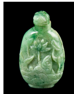
Title: Snuff Bottle Primary Maker: Unknown Chinese Medium: carved green jade