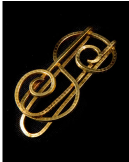
Title: Money Clip Medium: gold (14K)