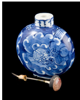
Title: Snuff Bottle Medium: porcelain