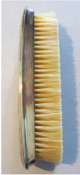
Title: Clothes Brush Date: c. 1910 Primary Maker: Unger Brothers Medium: sterling silver with wood