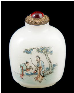
Title: Snuff Bottle Stopper Medium: metal; stone