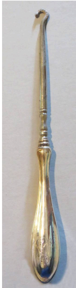
Title: Buttonhook Date: c. 1910 Primary Maker: Unger Brothers Medium: sterling silver with silver plated steel