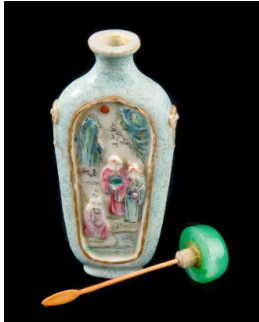
Title: Snuff Bottle Stopper Medium: jade and bone