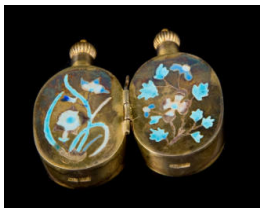
Title: Snuff Bottle Medium: metal