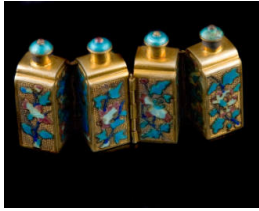
Title: Snuff Bottles Medium: metal; gold over silver