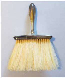
Title: Bonnet Brush Date: c. 1910 Primary Maker: Unger Brothers Medium: sterling silver with wood