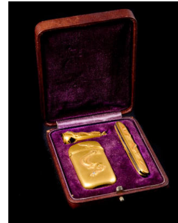
Title: Pocket Knife Primary Maker: Unknown German Medium: gilt-brass with diamond and other metal