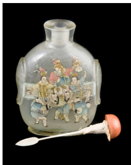
Title: Snuff Bottle Primary Maker: Unknown Chinese Medium: Peking glass