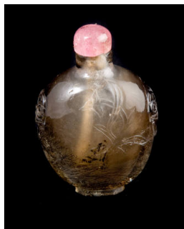
Title: Snuff Bottle Medium: carved quartz