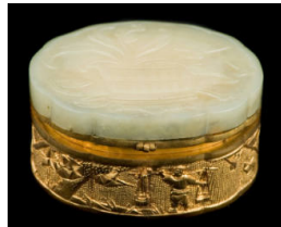
Title: Trinket Box Date: c. 1900 Primary Maker: Unknown Chinese Medium: metal; jade; glass