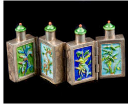
Title: Snuff Bottle Stopper Primary Maker: Unknown Chinese Medium: metal; enamel