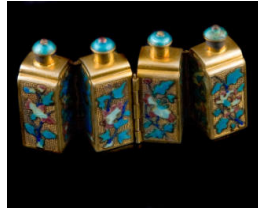
Title: Snuff Bottle Stopper Medium: enamel; metal