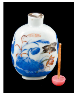
Title: Snuff Bottle Primary Maker: Unknown Japanese Medium: porcelain