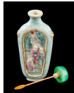
Title: Snuff Bottle Medium: porcelain