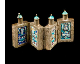
Title: Snuff Bottle Stopper Medium: threaded metal