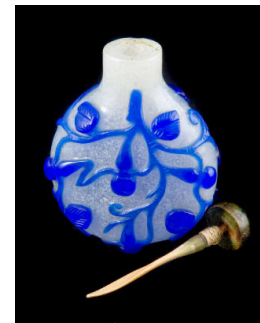
Title: Snuff Bottle Medium: Peking glass