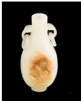
Title: Snuff Bottle Medium: soapstone