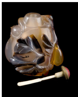
Title: Snuff Bottle Medium: carved quartz