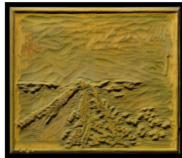
Title: Bound for Taos (Ochre Wood Block) Date: 1930 Primary Maker: Gustave Baumann Medium: basswood wood block