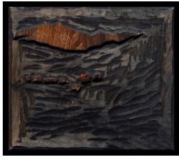
Title: Bound for Taos (Black Wood Block) Date: 1930 Primary Maker: Gustave Baumann Medium: basswood wood block