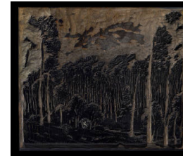
Title: Mountain Gold (Black Wood Block) Date: 1920 Primary Maker: Gustave Baumann Medium: basswood wood block