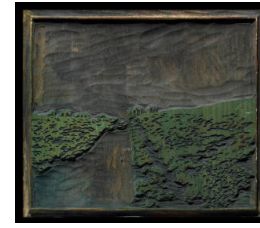
Title: Bound for Taos (Green Wood Block) Date: 1930 Primary Maker: Gustave Baumann Medium: basswood wood block