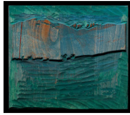
Title: Bound for Taos (Blue Wood Block) Date: 1930 Primary Maker: Gustave Baumann Medium: basswood wood block