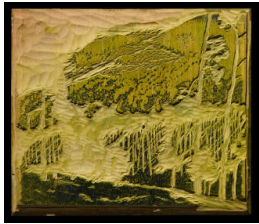
Title: Mountain Gold (Yellow Wood Block) Date: c. 1920 Primary Maker: Gustave Baumann Medium: basswood wood block