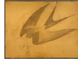
Title: Swallow-tailed Hawk Date: c. 1829 Primary Maker: John James Audubon Medium: engraved copper plate