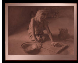
Title: The Potter Mixing Clay Date: 1921, copyright date; 1922 publication date Primary Maker: Edward S. Curtis Medium: copper