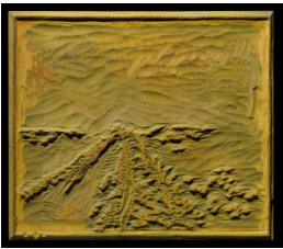
Title: Bound for Taos (Ochre Wood Block) Date: 1930 Primary Maker: Gustave Baumann Medium: basswood wood block