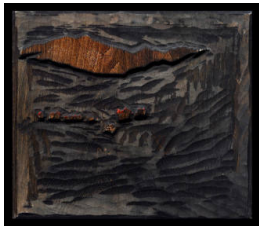
Title: Bound for Taos (Black Wood Block) Date: 1930 Primary Maker: Gustave Baumann Medium: basswood wood block