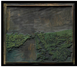
Title: Bound for Taos (Green Wood Block) Date: 1930 Primary Maker: Gustave Baumann Medium: basswood wood block