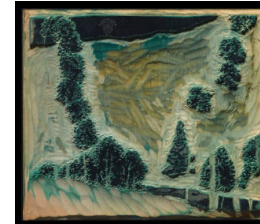
Title: Mountain Gold (Green Wood Block) Date: c. 1920 Primary Maker: Gustave Baumann Medium: basswood wood block