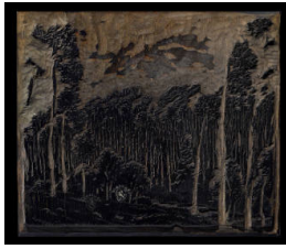
Title: Mountain Gold (Black Wood Block) Date: 1920 Primary Maker: Gustave Baumann Medium: basswood wood block