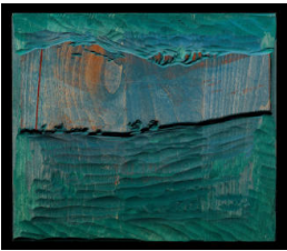
Title: Bound for Taos (Blue Wood Block) Date: 1930 Primary Maker: Gustave Baumann Medium: basswood wood block