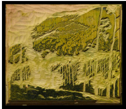
Title: Mountain Gold (Yellow Wood Block) Date: c. 1920 Primary Maker: Gustave Baumann Medium: basswood wood block