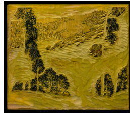
Title: Mountain Gold (Gold Wood Block) Date: c. 1920 Primary Maker: Gustave Baumann Medium: basswood wood block