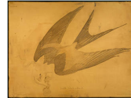
Title: Swallow-tailed Hawk Date: c. 1829 Primary Maker: John James Audubon Medium: engraved copper plate