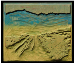
Title: Bound for Taos (Yellow and Blue Wood Block) Date: 1930 Primary Maker: Gustave Baumann Medium: basswood wood block