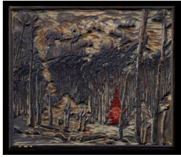
Title: Mountain Gold (Blue Wood Block) Date: c. 1920 Primary Maker: Gustave Baumann Medium: basswood wood block