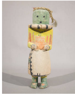
Title: Hakto Kachina Date: c. 1920 Primary Maker: Hopi Medium: carved cottonwood root, paint (natural pigments) and feathers