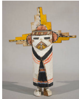
Title: Palhik Mana, Butterfly Kachina Maiden Date: c. 1920 Primary Maker: Hopi Medium: carved cottonwood root with paint (natural pigments)