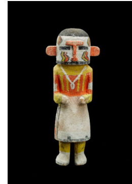
Title: Heheya Kachina Date: 1920-1930 Primary Maker: Hopi Medium: carved cottonwood root with natural pigments and feathers