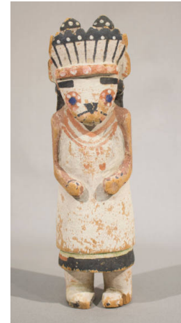
Title: Supai Kachina Date: c. 1925 Primary Maker: Hopi Medium: carved cottonwood root and mineral paints