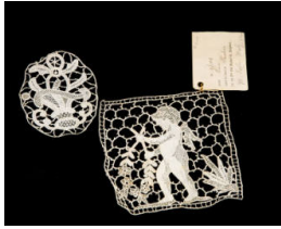
Title: Lace Insert Date: early 1900 Primary Maker: Unknown Belgian Medium: cotton or linen