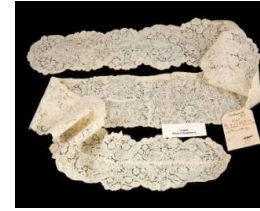
Title: Lappet Date: 1700-1799 Primary Maker: Unknown French Medium: lace