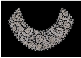
Title: Collar Date: 18th century Primary Maker: Unknown Italian Medium: linen