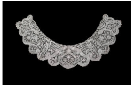
Title: Flounce Date: 18th Century Primary Maker: Unknown Flemish Medium: lace