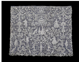
Title: Jabot Date: 18th Century Primary Maker: Unknown French Medium: lace; fabric