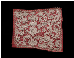
Title: Jabot Date: 17th Century Primary Maker: Unknown Italian Medium: gros point lace with fabric backing