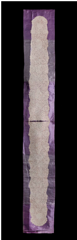
Title: Lappet Date: 18th century Primary Maker: Unknown French Medium: lace; silk