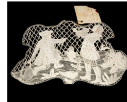
Title: Lace Primary Maker: Unknown Belgian Medium: cotton or linen