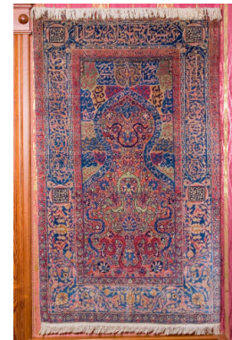
Title: Wall Hanging Date: c. 1903 Primary Maker: Kirmanshah Medium: woven wool