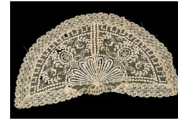
Title: Hair Piece Primary Maker: Unknown French Medium: lace