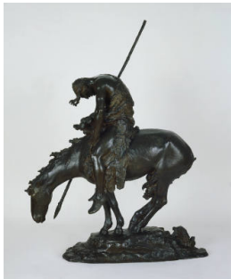
Title: The End of the Trail Date: 1918 Primary Maker: James Earle Fraser Medium: cast bronze