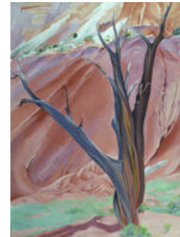
Title: Gerald's Tree II Date: 1937 Primary Maker: Georgia O'Keeffe Medium: oil on canvas