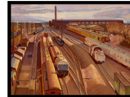
Title: The Chief Goes Through Date: 1956 Primary Maker: Ernest Leonard Blumenschein Medium: oil on canvas