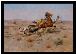
Title: Incident near Square Butte Date: 1897 Primary Maker: Charles Marion Russell Medium: oil on canvas