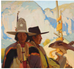
Title: Apaches Date: c. 1918 Primary Maker: Victor Higgins Medium: oil on canvas