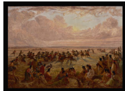
Title: Indian Women Playing Ball on the Prairie Date: 1848 Primary Maker: Seth Eastman Medium: oil on canvas