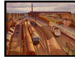
Title: The Chief Goes Through Date: 1956 Primary Maker: Ernest Leonard Blumenschein Medium: oil on canvas