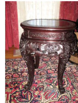
Title: Stool Date: c.1900 Primary Maker: Unknown Chinese Medium: mahogany