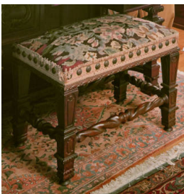
Title: Bench Date: c. 1900 Primary Maker: Unknown American Medium: mahogany with cloth and brass