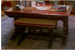
Title: Trestle Table Date: c. 1900 Primary Maker: Unknown American Medium: mahogany