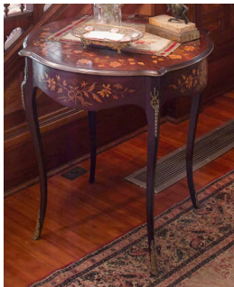
Title: Side Table Primary Maker: Unknown French Medium: mahogany with oak, satinwood, and ivory and metal