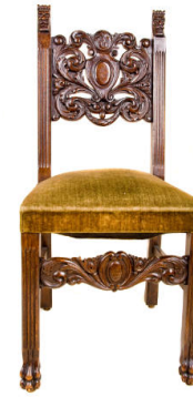
Title: Side Chair Date: c.1900 Medium: fumed oak with velvet and metal