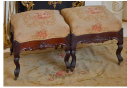
Title: Stool Date: c. 1900 Primary Maker: Unknown American Medium: mahogany with cloth and brass