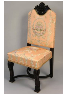
Title: Dining Room Side Chair Date: c.1900 Medium: mahogany with metal and silk with burlap, linen and horse hair