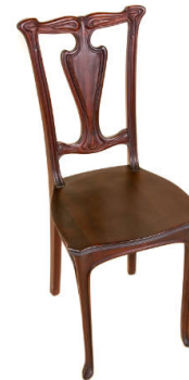
Title: Side Chair Date: c. 1920 Primary Maker: Robert Mitchell Furniture Company Medium: mahogany