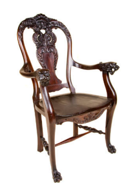
Title: Armchair Date: c.1900 Primary Maker: Robert Mitchell Furniture Company Medium: mahogany with cloth