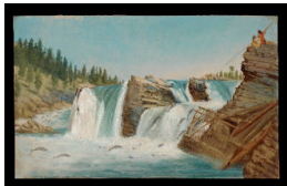
Title: Kettle Falls Date: 1847 Primary Maker: Paul Kane Medium: oil on paper