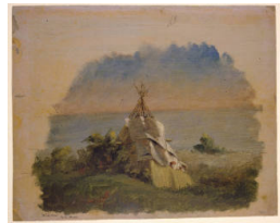
Title: Wigwam Date: 1845 Primary Maker: Paul Kane Medium: oil on paper