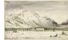
Title: Jasper House Date: 1846 Primary Maker: Paul Kane Medium: watercolor and pencil on paper