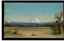
Title: Mount St. Helens Erupting Date: 1847 Primary Maker: Paul Kane Medium: oil on paper