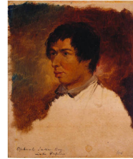
Title: Ojibwa Indian Boy from Lake Superior Date: 1845 Primary Maker: Paul Kane Medium: oil on paper