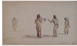
Title: Studies of Scalp Dance Date: 1847 Primary Maker: Paul Kane Medium: watercolor and pencil on paper