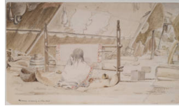
Title: Interior of a Lodge with Indian Woman Weaving a Blanket Date: 1847 Primary Maker: Paul Kane Medium: watercolor and pencil on paper