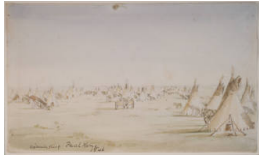
Title: Metis Encampment Date: 1846 Primary Maker: Paul Kane Medium: watercolor and pencil on paper