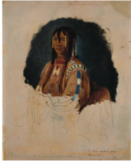
Title: Cree Indian Date: 1848 Primary Maker: Paul Kane Medium: oil on paper