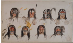
Title: Painted Faces of Eight Attendant Women Dancers Date: 1847 Primary Maker: Paul Kane Medium: watercolor and pencil on paper