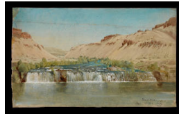
Title: Falls on the Upper Palouse Date: 1847 Primary Maker: Paul Kane Medium: oil on paper