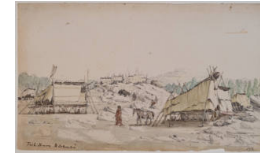
Title: Fish Houses, Columbia River Date: 1847 Primary Maker: Paul Kane Medium: watercolor and pencil on paper