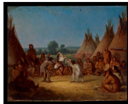
Title: Medicine Pipe Stem Dance Date: 1848 Primary Maker: Paul Kane Medium: oil on paper