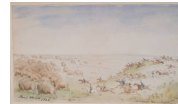
Title: Metis Chasing the Main Buffalo Herd Date: 1846 Primary Maker: Paul Kane Medium: watercolor and pencil on paper