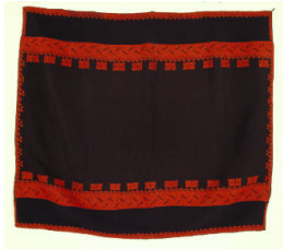
Title: Manta Date: 1860-1870 Primary Maker: Acoma Pueblo Medium: natural handspun wool and bayeta (unraveled wool cloth)