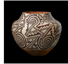
Title: Jar Primary Maker: Acoma Pueblo Medium: clay with white slip and black pigment