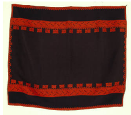
Title: Manta Date: 1860-1870 Primary Maker: Acoma Pueblo Medium: natural handspun wool and bayeta (unraveled wool cloth)