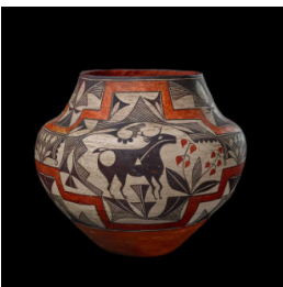
Title: Jar Primary Maker: Acoma Pueblo Medium: clay with black, red and white pigment