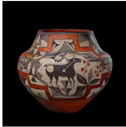
Title: Jar Primary Maker: Acoma Pueblo Medium: clay with black, red and white pigment