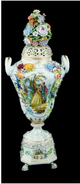
Title: Urn Date: 1872-1901 Primary Maker: Saxon Porcelain Manufactory Medium: porcelain