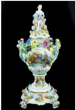
Title: Urn Base Date: 1872-1901 Primary Maker: Saxon Porcelain Manufactory Medium: porcelain