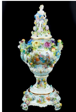
Title: Urn Lid Date: 1872-1901 Primary Maker: Saxon Porcelain Manufactory Medium: porcelain