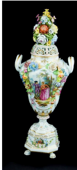
Title: Urn Date: 1872-1901 Primary Maker: Saxon Porcelain Manufactory Medium: porcelain