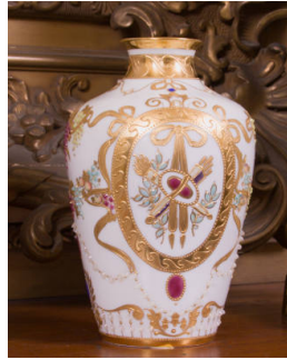
Title: Vase Date: c. 1920 Primary Maker: Saxon Porcelain Manufactory Medium: porcelain with enamel