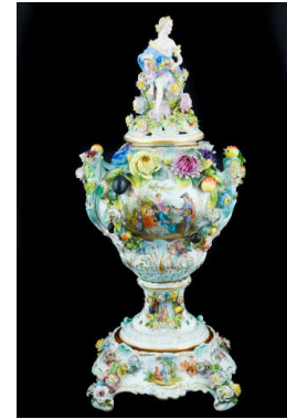
Title: Urn Date: 1872-1901 Primary Maker: Saxon Porcelain Manufactory Medium: porcelain