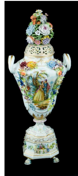
Title: Urn Lid Date: 1872-1901 Primary Maker: Saxon Porcelain Manufactory Medium: porcelain