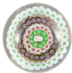
Title: Paperweight Date: c. 1930 Primary Maker: Baccarat Glasshouse Medium: glass