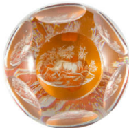
Title: Paperweight Date: c. 1850 Primary Maker: Baccarat Glasshouse Medium: glass