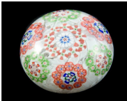
Title: Paperweight Date: c. 1850 Primary Maker: Baccarat Glasshouse Medium: glass