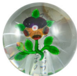
Title: Paperweight Date: c. 1855 Primary Maker: Baccarat Glasshouse Medium: glass