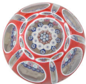
Title: Paperweight Date: c. 1850 Primary Maker: Baccarat Glasshouse Medium: glass