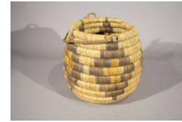
Title: Basket Date: c. 1890 Primary Maker: Hopi Medium: woven yucca with vegetable dyes