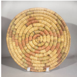
Title: Basket Plaque Primary Maker: Hopi Medium: woven reed and grass