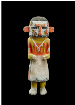
Title: Heheya Kachina Date: 1920-1930 Primary Maker: Hopi Medium: carved cottonwood root with natural pigments and feathers