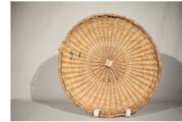
Title: Basket Plaque Primary Maker: Hopi Medium: woven reed and grass