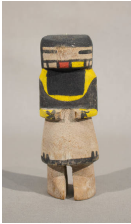
Title: Angák'china, Long Hair Kachina Date: c. 1920-1925 Primary Maker: Hopi Medium: carved cottonwood root with paint (natural pigments) and feather