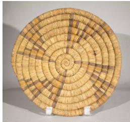
Title: Basket Plaque Primary Maker: Hopi Medium: woven reed and grass