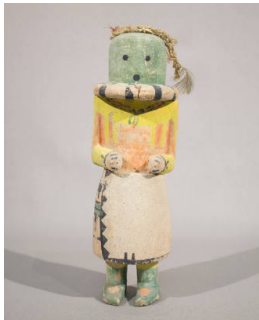
Title: Hakto Kachina Date: c. 1920 Primary Maker: Hopi Medium: carved cottonwood root, paint (natural pigments) and feathers