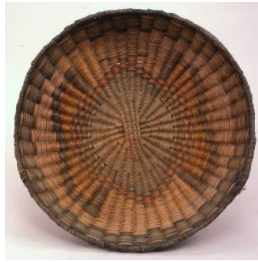
Title: Basket Primary Maker: Hopi Medium: woven rabbit brush and currant brush with vegetable dyes