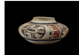
Title: Jar Date: c. 1900 Primary Maker: Hopi Medium: clay with white slip and black and red pigments