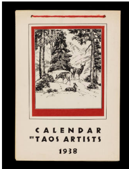
Title: Taos Calendar-1938 Date: c. 1938 Primary Maker: Helen Greene Blumenschein Medium: photomechanical metal relief print on paper