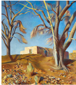
Title: New Mexico Landscape