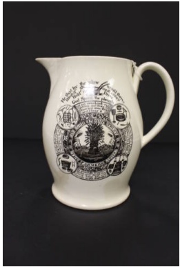
Title: Pitcher Primary Maker: Herculaneum Pottery Medium: creamware with transfer print