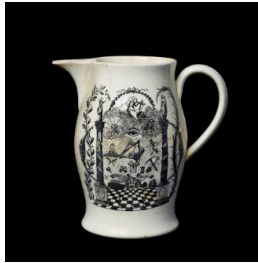
Title: Pitcher Date: c. 1800 Primary Maker: Herculaneum Pottery Medium: creamware with transfer print