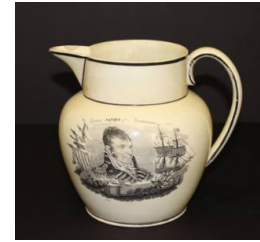
Title: Pitcher Primary Maker: Herculaneum Pottery Medium: creamware with transfer print