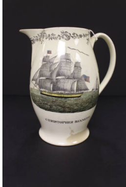
Title: Pitcher Primary Maker: Herculaneum Pottery Medium: creamware with transfer print