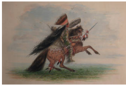
Title: Pa-ris-ka-roo-pa Date: 1852 Primary Maker: George Catlin Medium: pencil and watercolor on cardboard