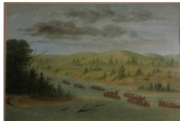
Title: La Salle and Party, in Eight Bark Canoes, Entering the Mississippi Date: after 1848 Primary Maker: George Catlin Medium: oil on heavy paper