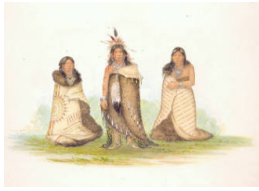
Title: Hongs-kay-dee, Hee-lah-de, Mong-shong-shaw Date: 1852 Primary Maker: George Catlin Medium: pencil and watercolor on cardboard