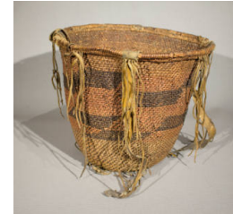
Title: Burden Basket Date: c. 1880 Primary Maker: Apache Medium: woven sumac, devil's claw and split willow