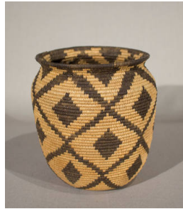
Title: Basket Date: c. 1900-1920 Primary Maker: Apache Medium: woven willow and devil's claw