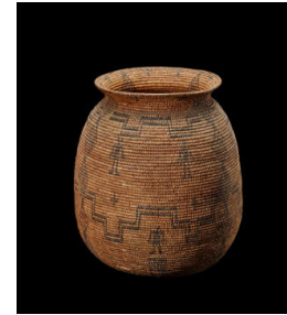
Title: Basket Primary Maker: Apache Medium: woven willow and devil's claw