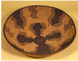
Title: Basket Date: c. 1900 Primary Maker: Apache Medium: woven willow and devil's claw