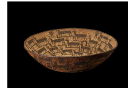
Title: Basket Date: c. 1900 Primary Maker: Apache Medium: woven sumac, devil's claw, and split willow