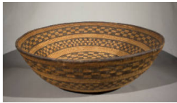
Title: Basket Date: c. 1900 Primary Maker: Apache Medium: woven sumac, devil's claw, and split willow