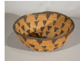
Title: Basket Date: c. 1900-1910 Primary Maker: Apache Medium: woven sumac, devil's claw, and split willow