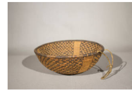
Title: Basket Date: c. 1885 Primary Maker: Apache Medium: woven sumac, devil's claw, and split willow