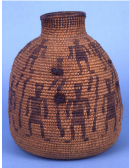
Title: Basket Date: c. 1880 Primary Maker: Apache Medium: woven sumac, devil's claw, and split willow with leather