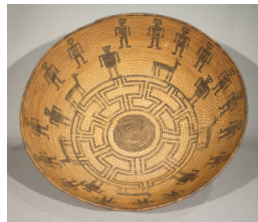
Title: Storage Basket Date: c. 1900 Primary Maker: Apache Medium: woven sumac, devil's claw, and split willow