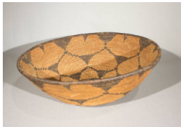
Title: Basket Date: c. 1900 Primary Maker: Apache Medium: woven sumac, devil's claw and split willow