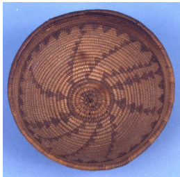
Title: Basket Date: c. 1900 Primary Maker: Apache Medium: woven sumac, devil's claw, and split willow