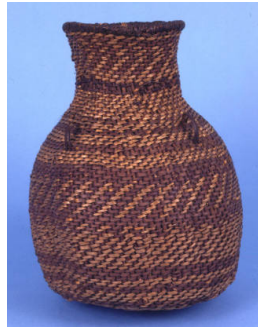
Title: Burden Basket Date: c. 1900-1920 Primary Maker: Apache Medium: woven split willow, and sumac