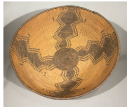
Title: Basket Date: c. 1890 Primary Maker: Apache Medium: woven sumac, devil's claw, and split willow