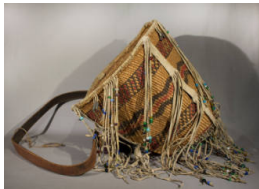
Title: Burden Basket Primary Maker: Apache Medium: woven sumac, devil's claw and split willow with red paint, leather, beads and metal bangles