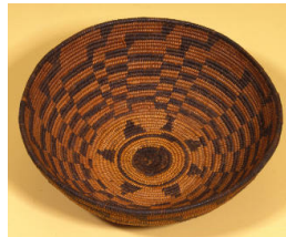
Title: Basket Date: c. 1900 Primary Maker: Apache Medium: woven sumac, devil's claw and split willow