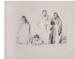
Title: Watching the Ceremony Date: plate made c. 1925, printed 1991, posthumously Primary Maker: Ernest Martin Hennings Medium: etching on paper