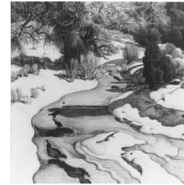
Title: The Frozen Stream Date: c. 1924-1925 Primary Maker: Ernest Martin Hennings Medium: lithograph on paper