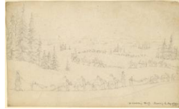
Title: A Wedding Party Traveling by Dog Sledge