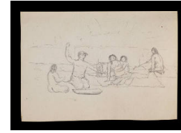
Title: Study of Group in Lodge Interior