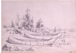
Title: Two Canoes on a Rocky Shoreline