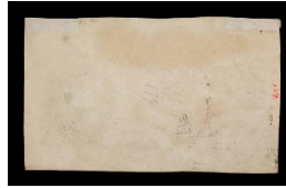
Title: Sketch of wigwam with bear design and seated man with hat and standing male