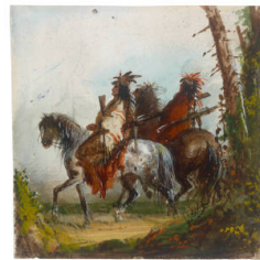
Title: Shoshone Indian Hunters Date: 1837 Primary Maker: Alfred Jacob Miller Medium: watercolor with pen and ink on paper