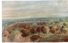
Title: Buffalo Hunting