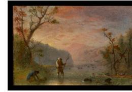
Title: Setting Traps for Beaver Date: after 1837 Primary Maker: Alfred Jacob Miller Medium: oil on academy board mounted to wood panel