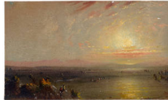
Title: Caravan on the Broad Prairie