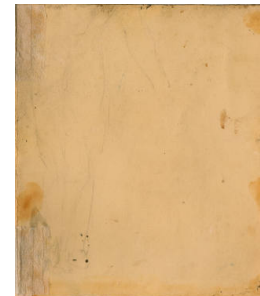
Title: Sketch of partial human body Date: 1837 Primary Maker: Alfred Jacob Miller Medium: pencil on paper