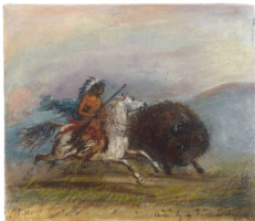
Title: Chase by Pawnee Indians

Medium: watercolor with pen and ink on paper