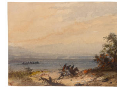
Title: Shoshones Escaping from Hostile Indians Date: 1837 Primary Maker: Alfred Jacob Miller Medium: watercolor on paper