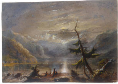
Title: Oregon Lake by Moonlight Date: 1837 Primary Maker: Alfred Jacob Miller Medium: watercolor on paper