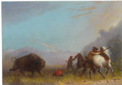
Title: Buffalo Strikes Back