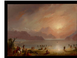
Title: Departure of the War Canoe

Medium: pen and ink, ink wash, with pencil and gouache on paper