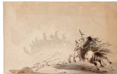
Title: Clouds of Dust

Medium: watercolor with pen and ink on paper