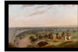
Title: Buffalo Hunting

Medium: watercolor with pen and ink on paper