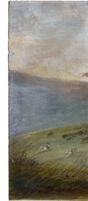
Title: Chase by Pawnee Indians