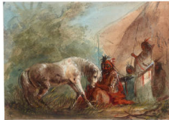
Title: Shoshone Caressing his Horse Date: 1837 or after Primary Maker: Alfred Jacob Miller Medium: watercolor with pen and ink on paper