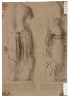
Title: Sketch of antique sculpture of figure Date: 1837 Primary Maker: Alfred Jacob Miller Medium: charcoal on paper