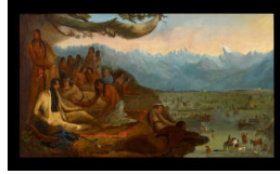
Title: Pipe of Peace at the Rendezvous Date: c. 1839 Primary Maker: Alfred Jacob Miller Medium: oil on canvas