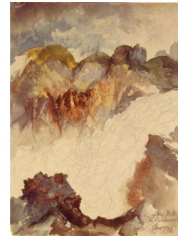
Title: Upper Fall of the Yellowstone Date: 1892 Primary Maker: Thomas Moran Medium: watercolor and pencil on paper