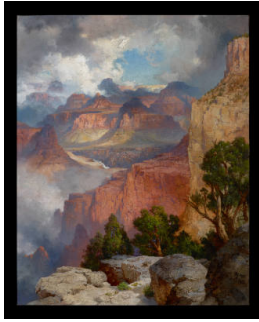
Title: Mojave Wall Date: 1915 Primary Maker: Thomas Moran Medium: oil on canvas