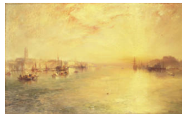
Title: Untitled Date: 1884 Primary Maker: Thomas Moran Medium: oil on canvas