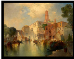
Title: The City of the Caliphs Date: 1919 Primary Maker: Thomas Moran Medium: oil on canvas