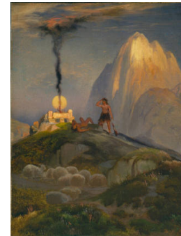
Title: Hiawatha Date: 1870 Primary Maker: Thomas Moran Medium: oil on canvas mounted on wood