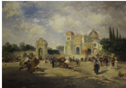
Title: The Plaza, San Juan, Abajo, Mexico Date: 1884 Primary Maker: Thomas Moran Medium: oil on canvas