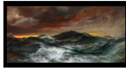
Title: A Norther in the Gulf of Mexico Date: 1884 Primary Maker: Thomas Moran Medium: oil on canvas