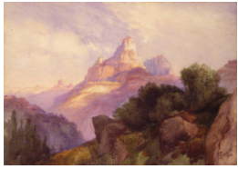
Title: Cathedral Rock Date: 1902 Primary Maker: Thomas Moran Medium: watercolor on paper