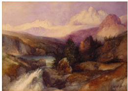
Title: The Great Tetons, Idaho Date: 1898 Primary Maker: Thomas Moran Medium: watercolor on paper