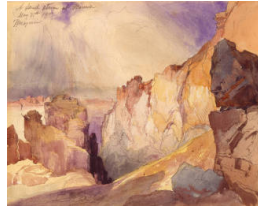
Title: A Sand Storm at Acoma Date: 1901 Primary Maker: Thomas Moran Medium: watercolor and pencil on paper