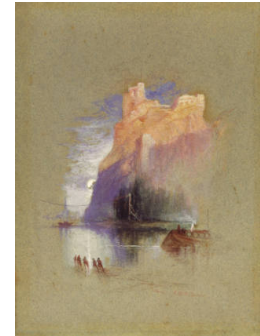
Title: Cliff Scene, Boats in Moonlight Primary Maker: Thomas Moran Medium: watercolor on paper