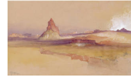
Title: Ship Rock, Arizona Date: 1892 Primary Maker: Thomas Moran Medium: watercolor and pencil on paper