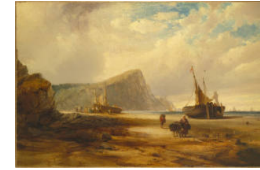
Title: On the Beach Date: 1852 Primary Maker: Thomas Moran Medium: oil on canvas