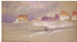
Title: Green River Buttes, Wyoming Date: 1881 Primary Maker: Thomas Moran Medium: watercolor and pencil on paper