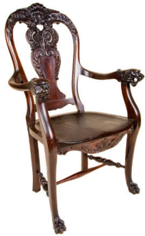
Title: Armchair Date: c.1900 Primary Maker: Robert Mitchell Furniture Company Medium: mahogany with cloth