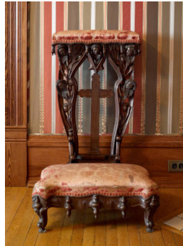
Title: Prie-Dieu Bench Date: c. 1890 Medium: mahogany; brocade