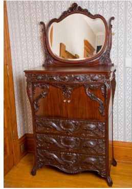
Title: Chiffonier Date: c. 1920 Primary Maker: Robert Mitchell Furniture Company Medium: mahogany with glass and metal